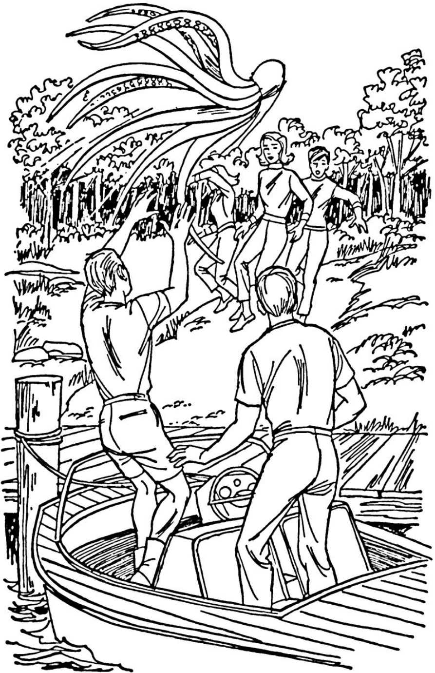
"Look out!" Burt cried