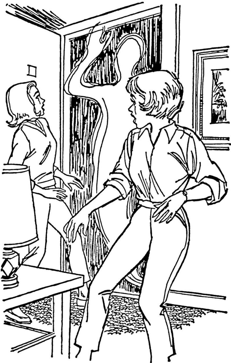
The ghostlike figure raised an arm menacingly