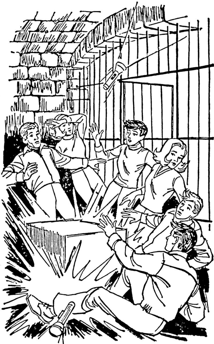
The explosion knocked the ghost hunters off their feet