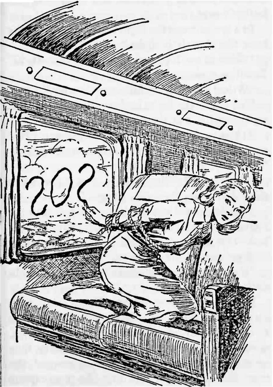
Nancy wrote a large SOS backwards on the pane

Meanwhile, back at the airport, Ned Nickerson had arranged to charter the helicopter. He had come from the building and had been surprised to see Nancy go into the small two-engine plane. Then, the next moment, it had suddenly taken off.