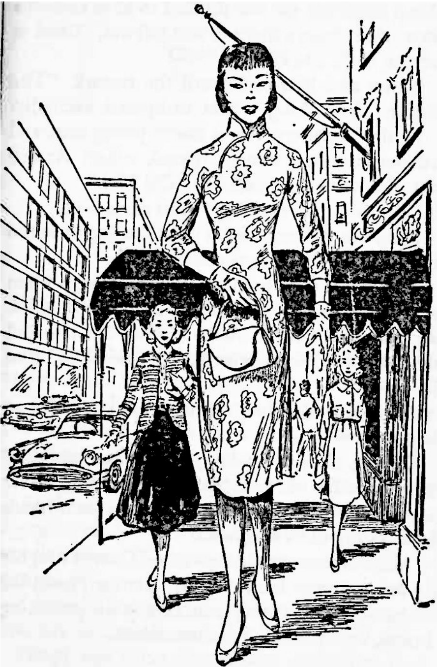
Nancy and Bess stayed far enough behind George not to arouse suspicion

When the girls reached the Columbia campus, George smiled at various students as they came along. Suddenly she was thrilled to have someone wave to her from a distance and call