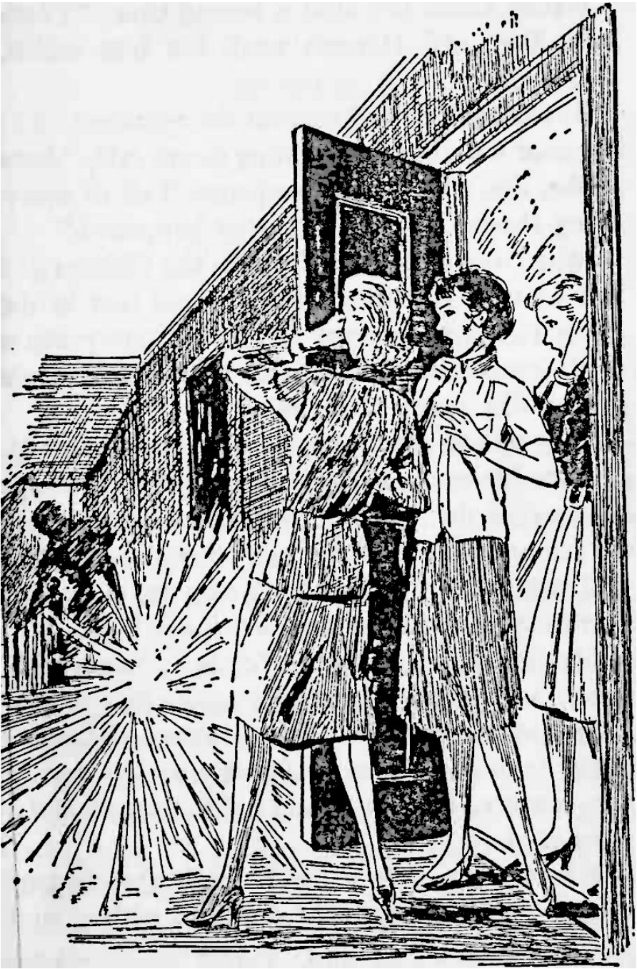
Something in front of Nancy exploded with a loud bang!

Nancy kissed her aunt a second time. "That's from Dad, and Hannah sends her best wishes, too."