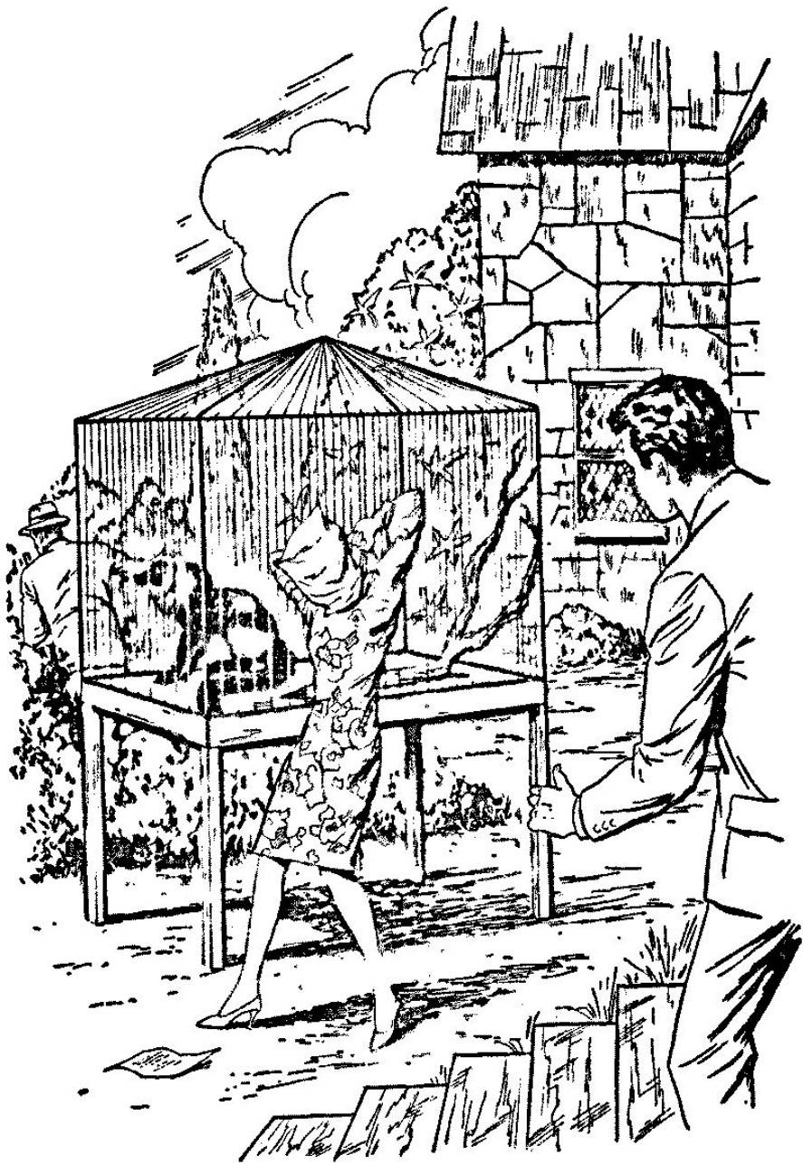
Nancy's struggles to free herself were in vain