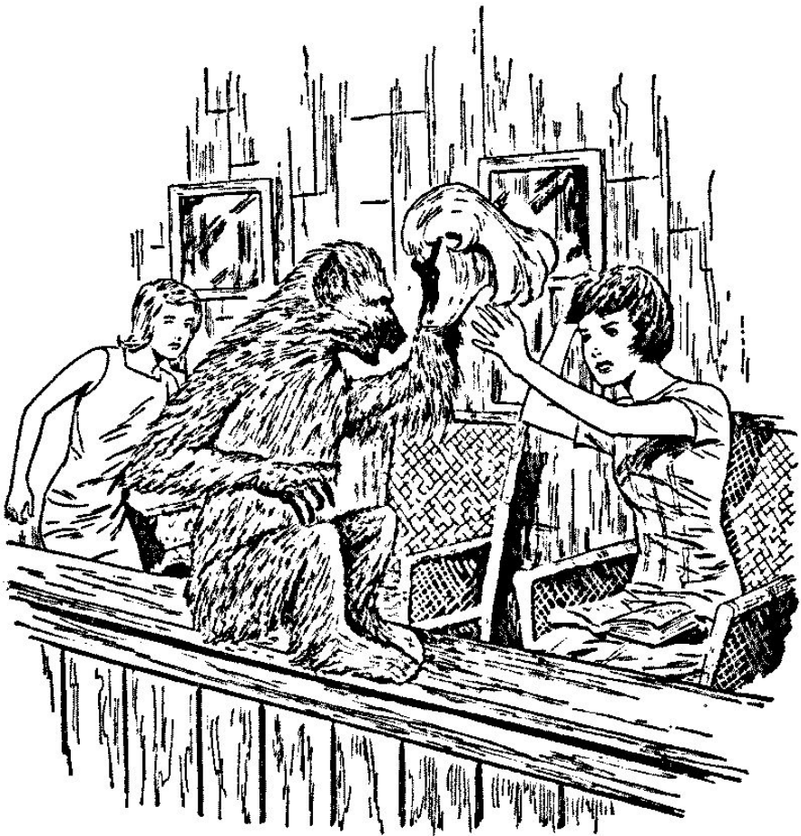
The baboon snatched off Gwen's wig

"She's probably sulking because Hal scolded her," George guessed.