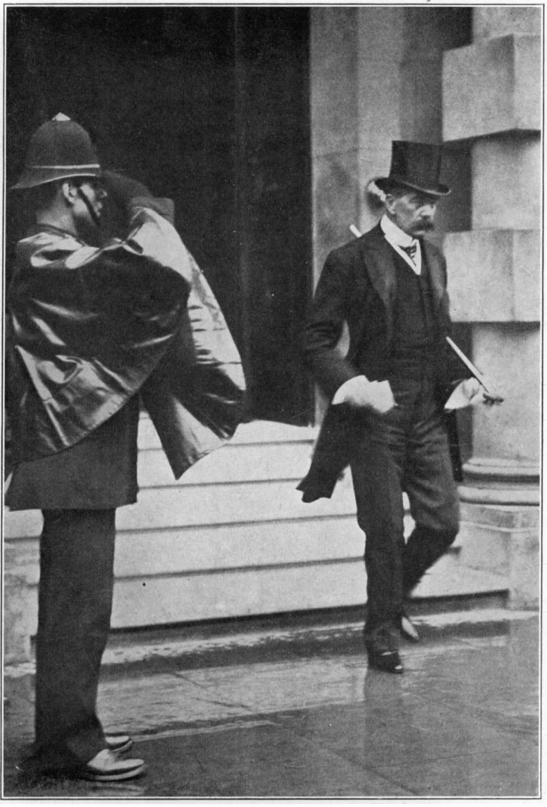
"And now nearly all the candles but one —that of life itself—are out."