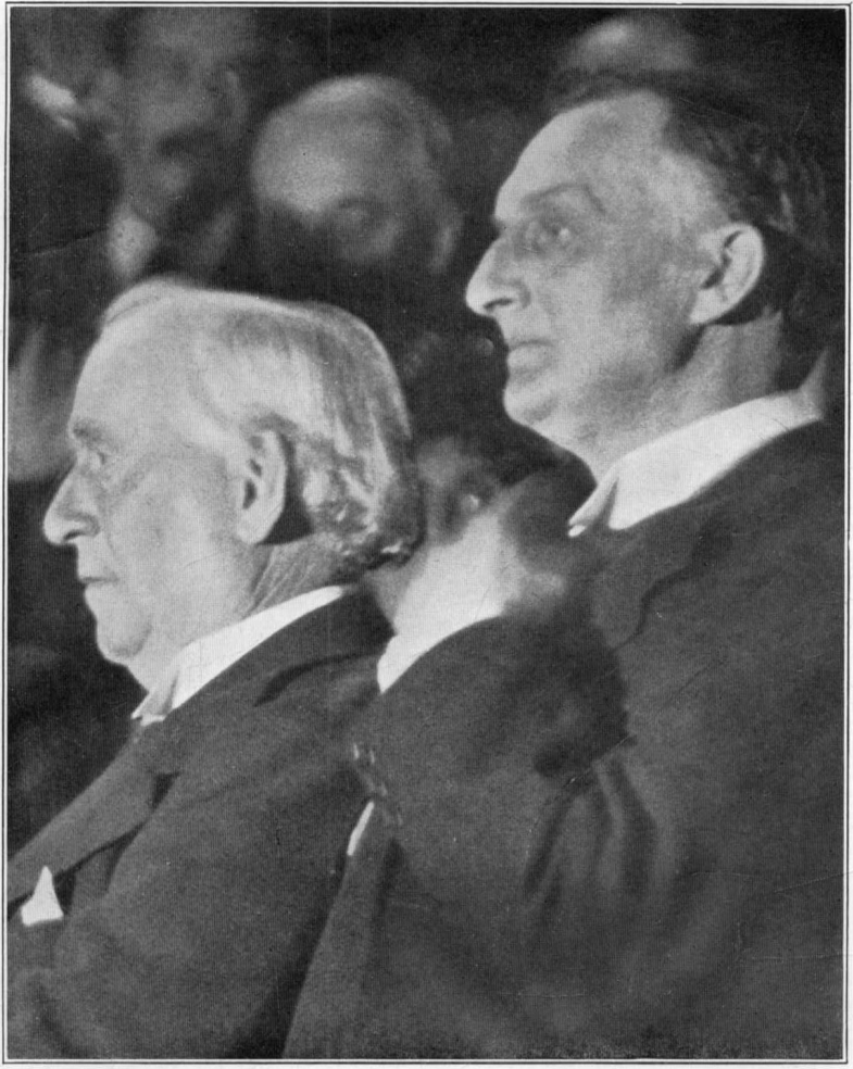
"His relations with Grey were of that distant but friendly kind which an ocean might have with a contiguous mountain peak."

the Prime Minister, who, in spite of demonstration after demonstration of Bonar Law's commanding moral and political strength, could not realise either his wisdom or his power. It was only after Bonar Law's departure that Asquith applied to him the honourable and touching epithet "shrewd and gentle."