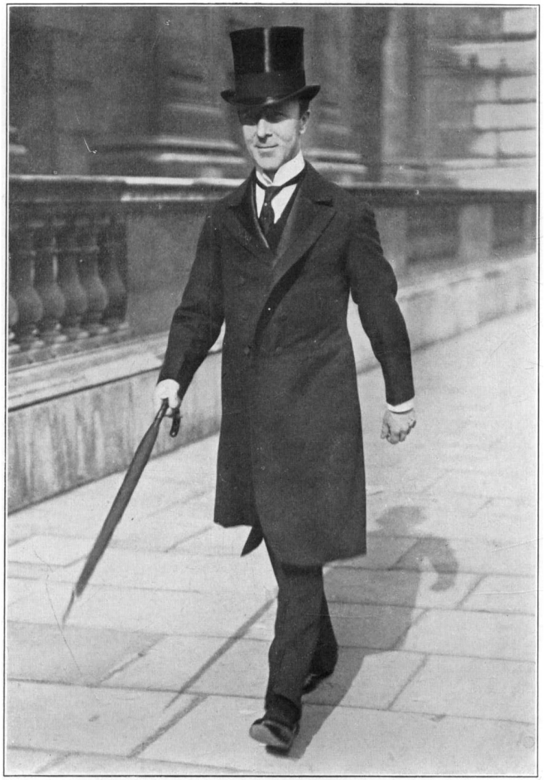
"Leave it to me."