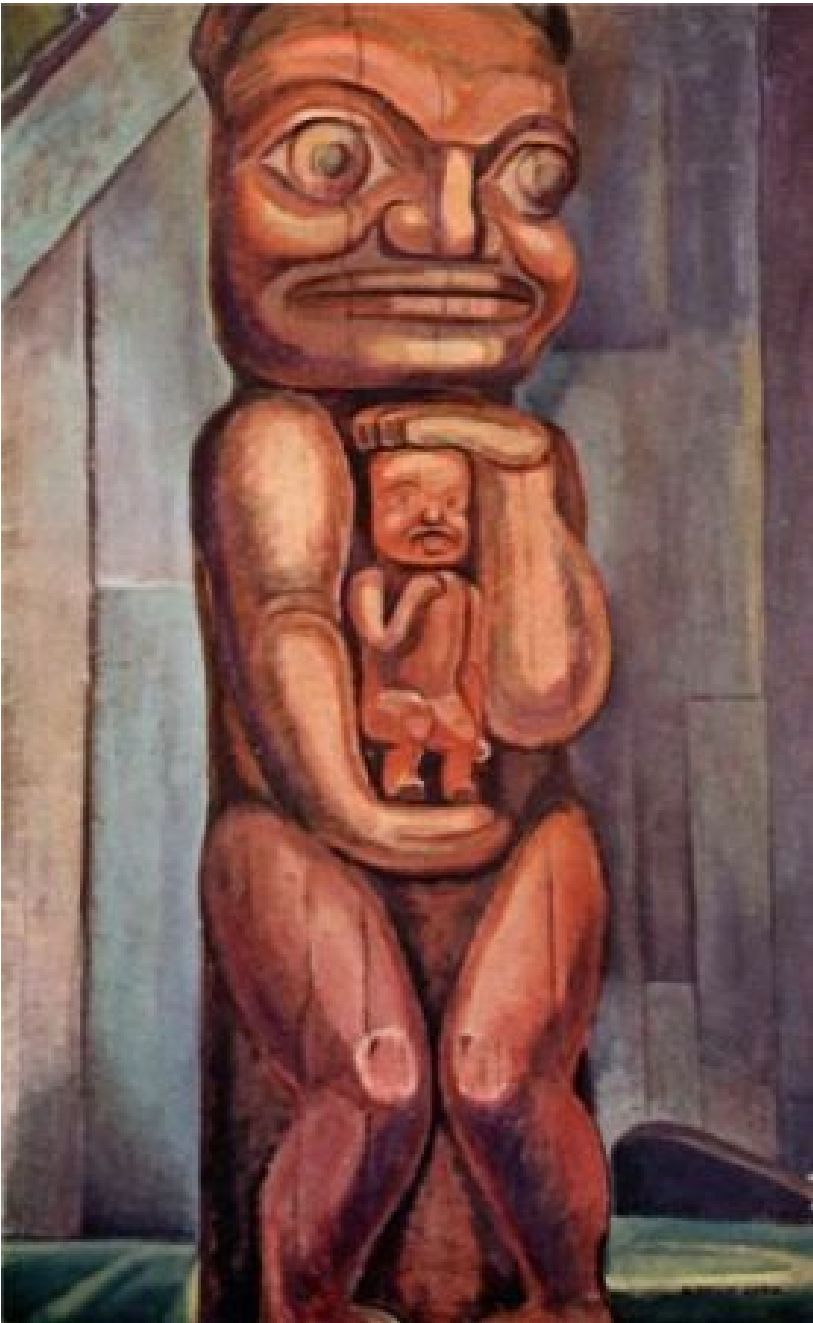
TOTEM MOTHER AND CHILD AT KITWANCOOL