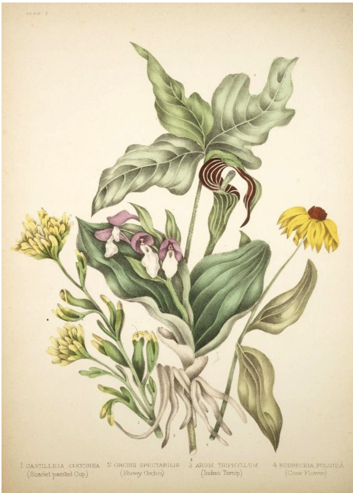
1 CASTILLEIA COCCINEA (Scarlet painted Cup)