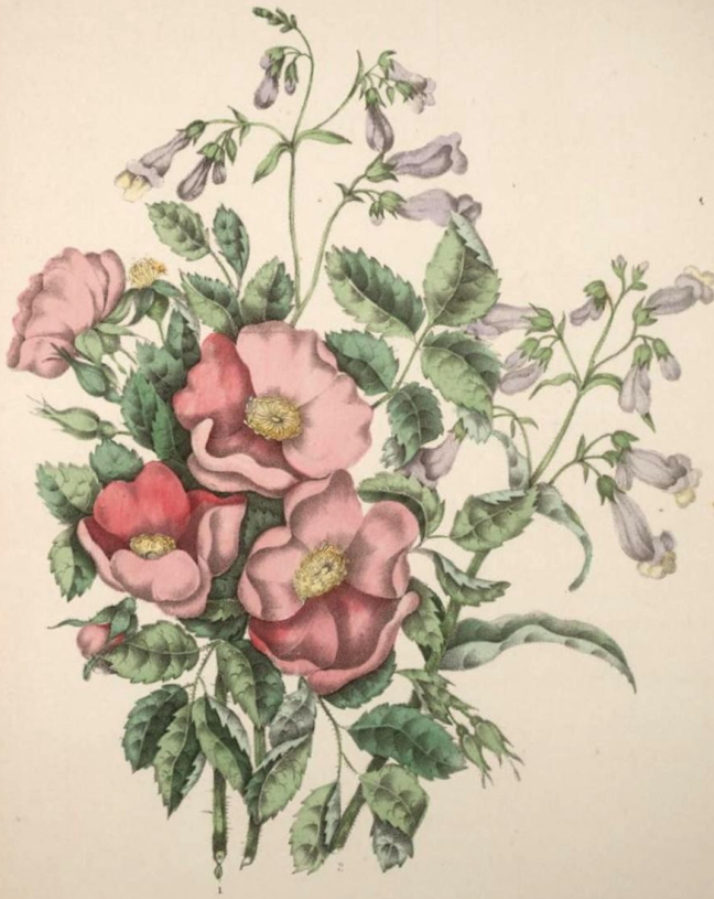
1 ROSA BLANDA (Early wild Rose)