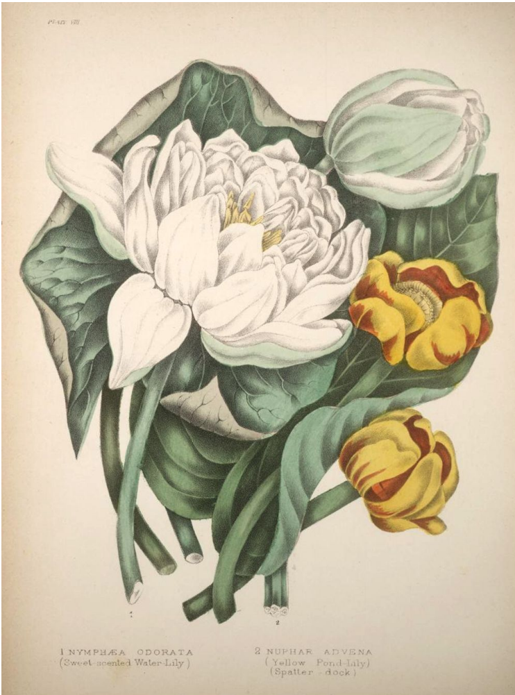
1 NYPHÆA ODORATA (Sweet scented Water-Lily)