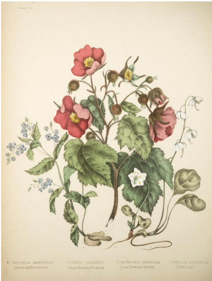
4 VERONICA AMERICANA (American Brooklime)