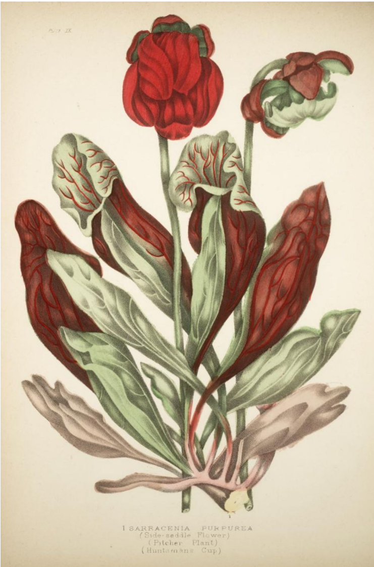
1 SARRACENIA PURPUREA (Side-saddle Flower) (Pitcher Plant) (Huntsman's Cup)