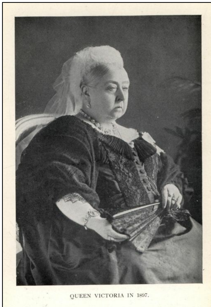
QUEEN VICTORIA IN 1897.