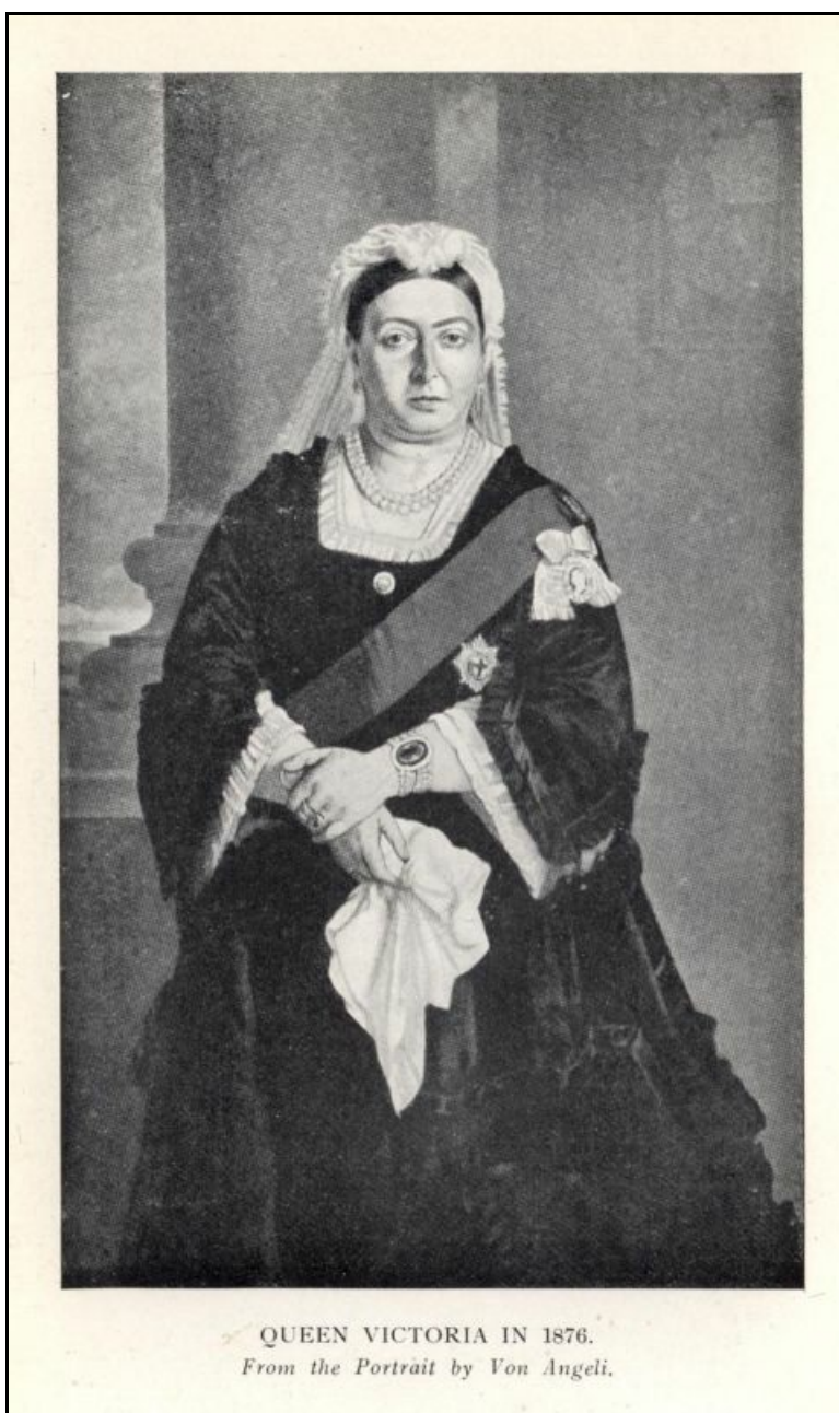
QUEEN VICTORIA IN 1876. From the Portrait by Von Angeli.

composition.'[2] Yet she regarded Mr. Gladstone with a distrust and dislike which steadily deepened, while upon his rival she lavished an abundance of confidence, esteem, and affection such as Lord Melbourne himself had hardly known.