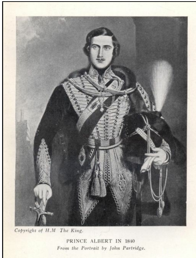
PRINCE ALBERT IN 1840. From the Portrait by John Partridge.

[70] Girlhood , II, 262-9. Greville's statement (Nov. 27, 1839) that 'the Queen settled everything about her marriage herself, and without consulting Melbourne at all on the subject, not even communicating to him her intention,' has no foundation in fact. The Queen's journal proves that she consulted Melbourne at every point.