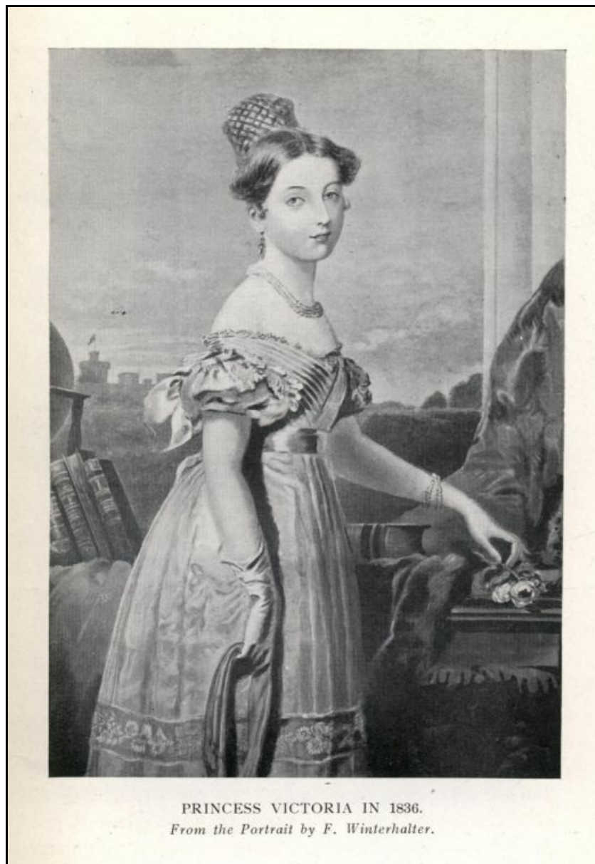
PRINCESS VICTORIA IN 1836. From the Portrait by F. Winterhalter.

Nevertheless, the Duke had other views: there were prophecies.... At any rate, he would christen the child Elizabeth, a name of happy augury. In this, however, he reckoned without the Regent, who, seeing a chance of annoying his brother, suddenly announced that he himself would be present at the baptism, and signified at the same time that one of the godfathers was to be the Emperor Alexander of Russia. And so when the ceremony took place, and the Archbishop of Canterbury asked by what name he was to baptise the child, the Regent replied 'Alexandrina.' At this the Duke ventured to suggest that another name might be added. 'Certainly,' said the Regent; 'Georgina?' 'Or Elizabeth?' said the Duke. There was a pause, during which the Archbishop, with the baby in his lawn sleeves, looked with some uneasiness from one Prince to the other. 'Very well, then,' said the Regent at last, 'call her after her mother. But Alexandrina must come first.' Thus, to the disgust of her father, the child was christened Alexandrina Victoria.[1]