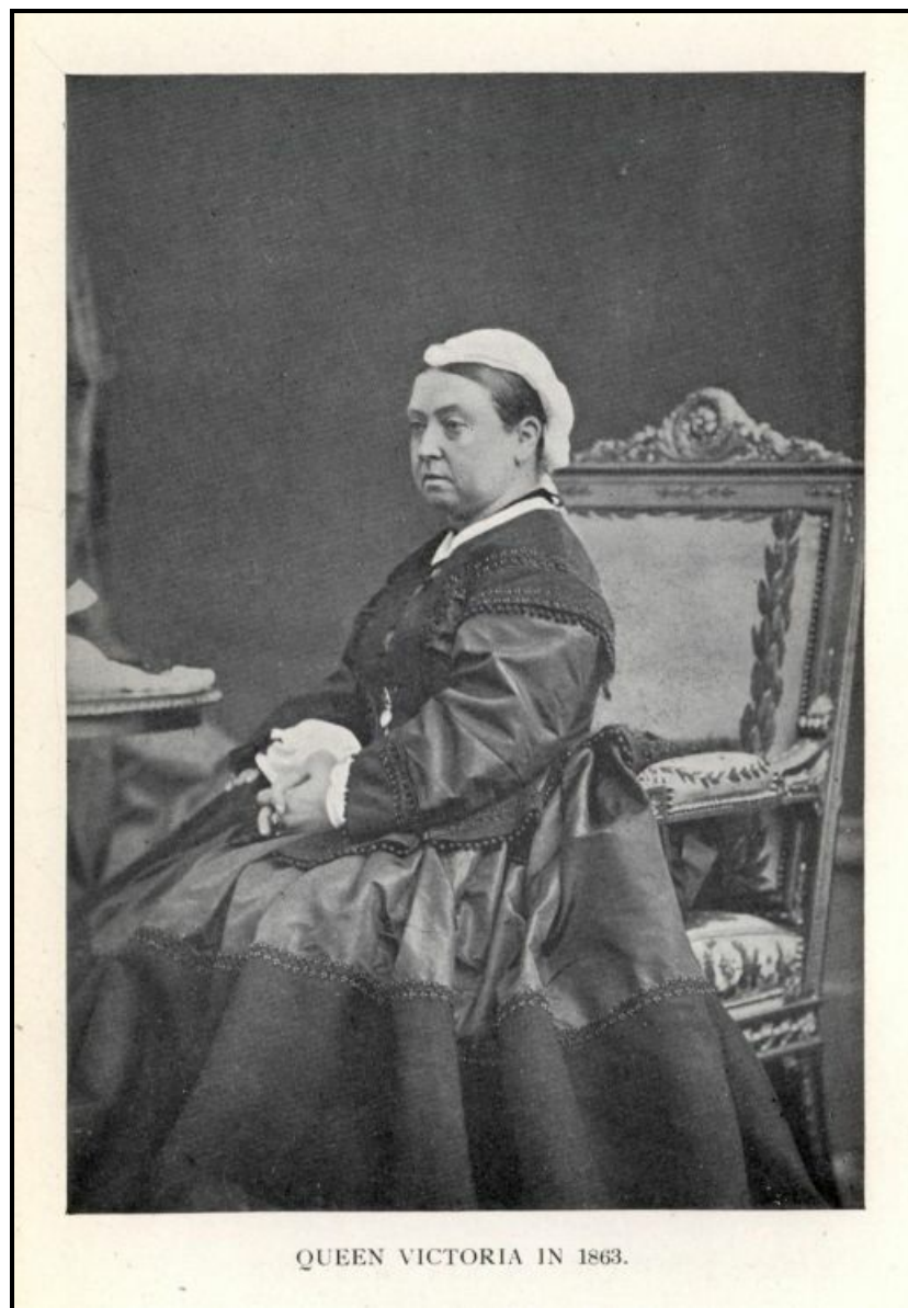
QUEEN VICTORIA IN 1863.