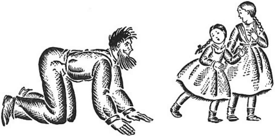
ONE GAME WAS CALLED MAD DOG

They were quick at dodging and running, but once he caught them against the woodbox, behind the stove. They couldn't get past Pa, and there was no other way out.