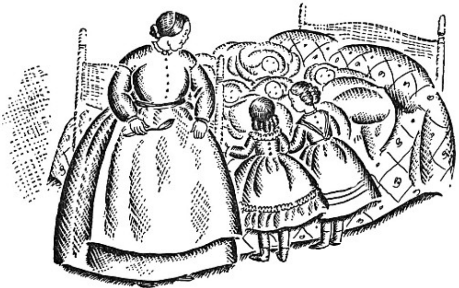
IN ROWS ON GRANDMA'S BED

People had begun to come. They were coming on foot through the snowy woods, with their lanterns, and they were driving up to the door in sleds and in wagons. Sleigh bells were jingling all the time.