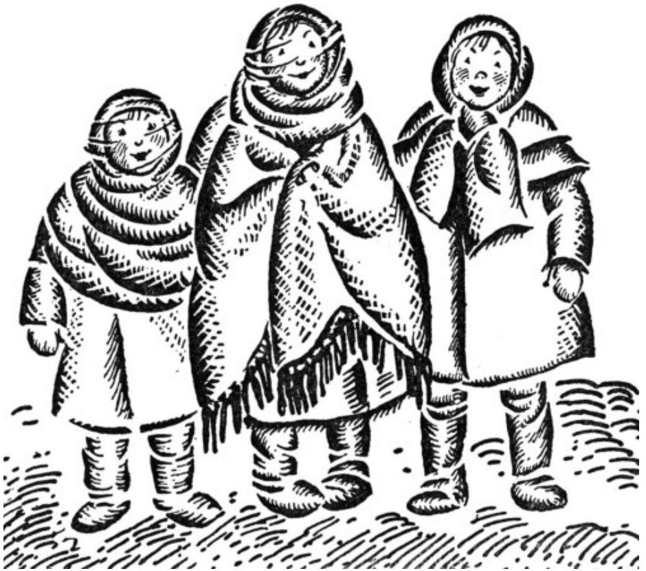
COATS AND MUFLERS AND VEILS AND SHAWLS

Ma was busy all day long, cooking good things for Christmas. She baked salt-rising bread and rye 'n Injun bread, and Swedish crackers, and a huge pan of baked beans, with salt pork and molasses. She baked vinegar pies and dried-apple pies, and filled a big jar with cookies, and she let Laura and Mary lick the cake spoon.