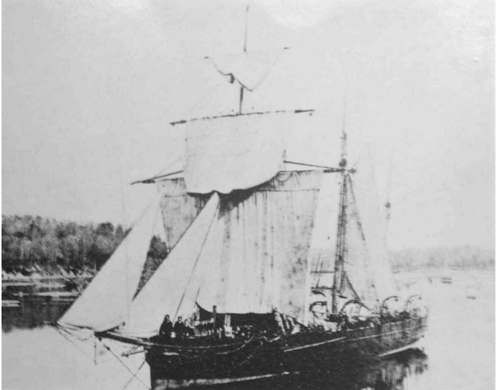
British gunboat H.M.S. Cherub, in Canadian service until 1874.

guard duties. She was offered for sale in 1889 and in the following year was removed from the Navy List.