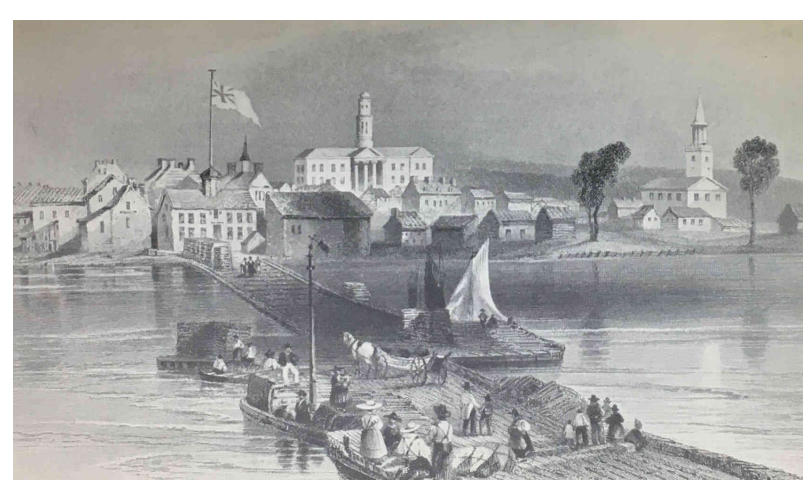
COBOURG IN 1841.