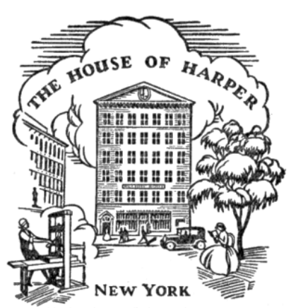
Publishers of BOOKS and of HARPER'S MAGAZINE Established 1817