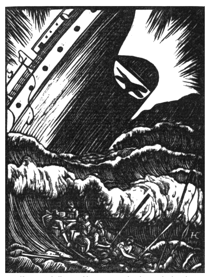
She gave a hollow rumbling groan, and without a check to the silent awe of the watchers, she went down.