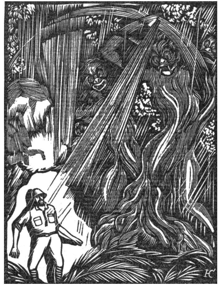
His prison opened suddenly, and skeletons of fire were capering around him.

It sounded as if the place was talking to itself, now it had got him; got him all round. Was it safe to wait under the precipice? There was a noise, up above, like the sea breaking. The storm was coming. What about repeating the Paternoster? Colet considered it. Couldn't remember it. The aisles filled with quivering blue fire; the trees danced. He had laughed at the men chanting the mantras for a safe journey. But he didn't know any mantras. Too late now to learn prayers and exemptions. Here it came. Poor old Parsell.