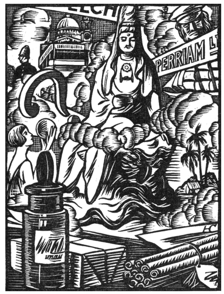
Only gradually did Kuan-yin, a luminous symbol of benignity amid alien things, show through the whirling haze of his thoughts.

He fingered one of the specifying labels. All the samples were labelled, though the marks on the tags were as mysterious as the stuff they identified. They announced merely the names of ships, and seasons, and the cabalistic port-marks of consignors. The objects mostly were but mummied relics, odorous suggestions entirely foreign, so that they gave Jimmy's room at Perriam's, to a caller, an indefinable air, as though it were concerned with the subtle traffic of Oriental mysteries. But Colet himself did not know the origin of most of the samples which littered his desk, nor what form they had when alive in whichever far islands and coasts were their homes. He did not always know for what purposes they were used here. Some were in bottles, with names, like collars, about their necks. Others were in trays, in