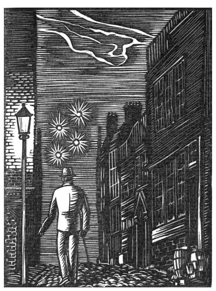
Yes, this was the edge of his world.