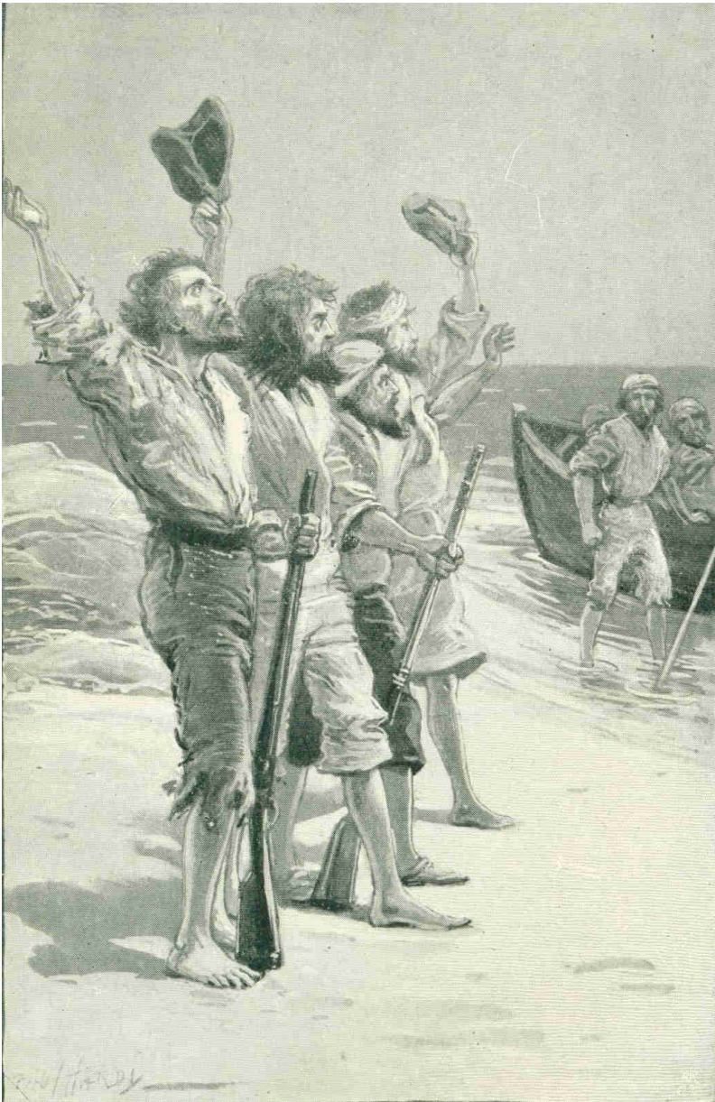
“THEY STOOD UPON THE BEACH GIVING US THREE CHEERS.”