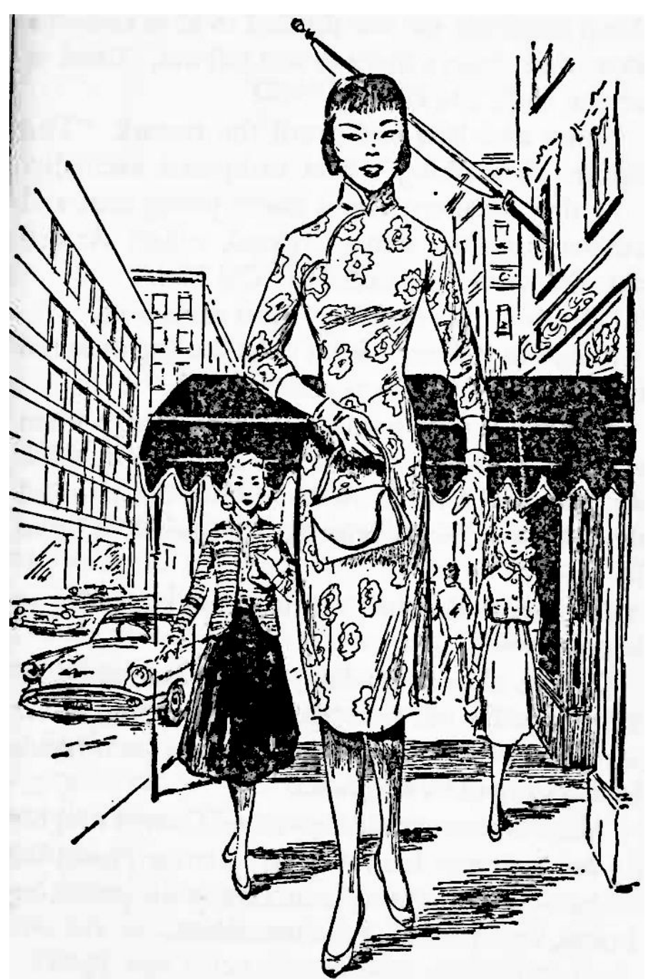
Nancy and Bess stayed far enough behind George not to arouse suspicion

When the girls reached the Columbia campus, George smiled at various students as they came along. Suddenly she was thrilled to have someone wave to her from a distance and call