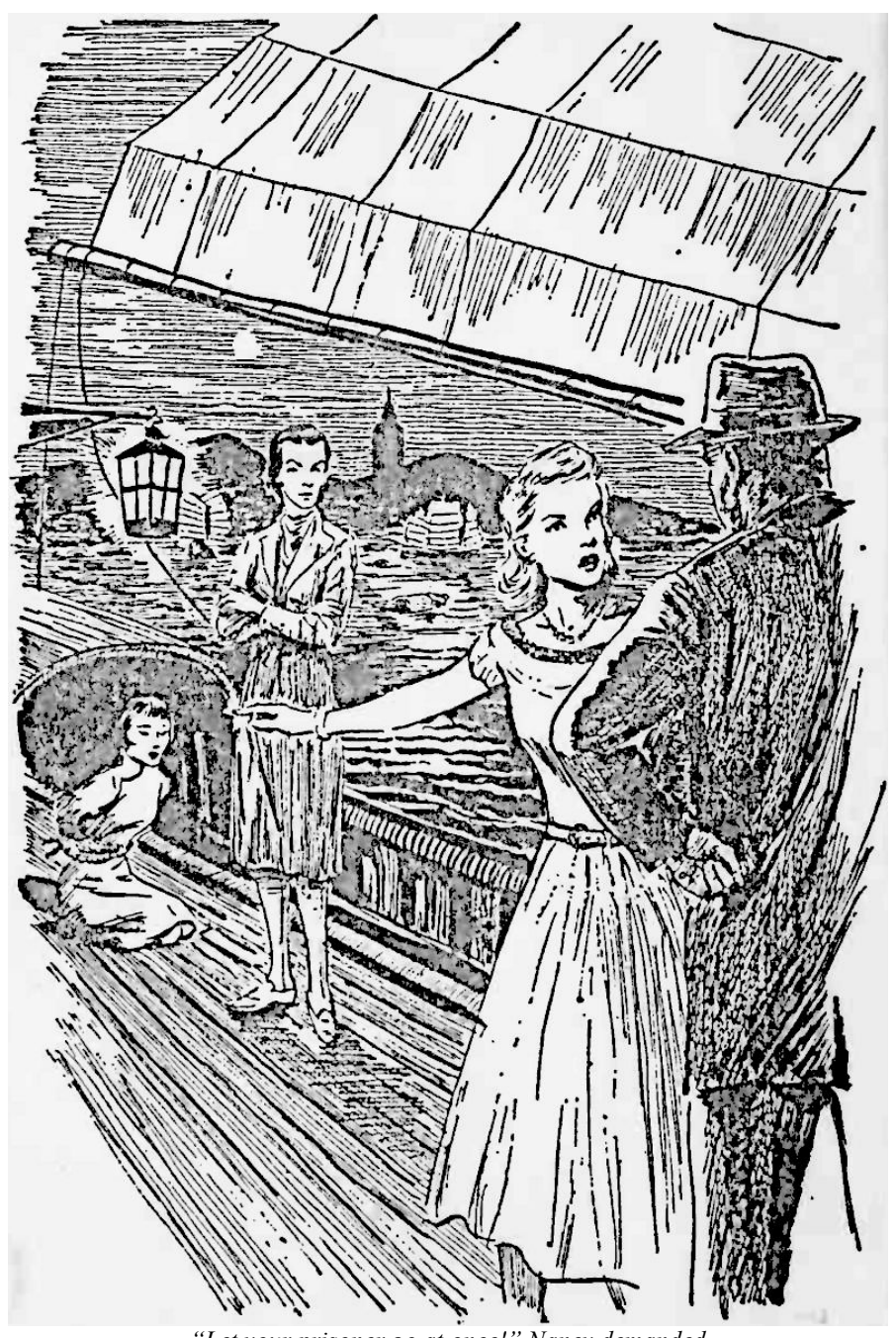
"Let your prisoner go at once!" Nancy demanded