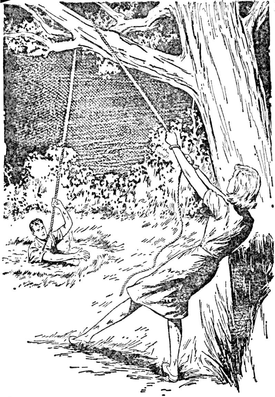
Nancy struggled to pull Ned from the quicksand

Immediately after breakfast the next morning, Nancy called at Mrs. Putney's home. The widow, looking very pale and tired, was wearing a dressing gown.