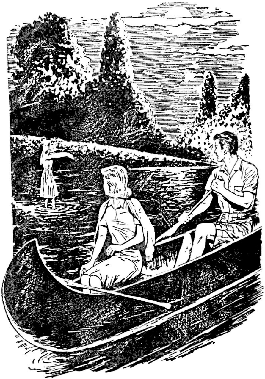
The ghostly figure was wading deeper into the water