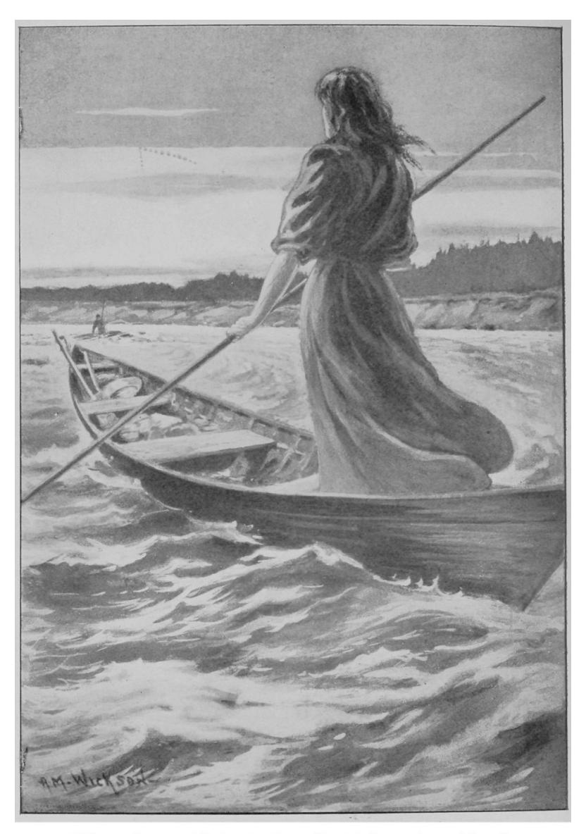
"There she stood balancing herself with her pole and keeping the boat's head straight."