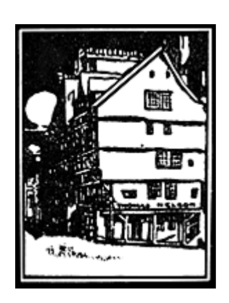
T. NELSON AND SONS