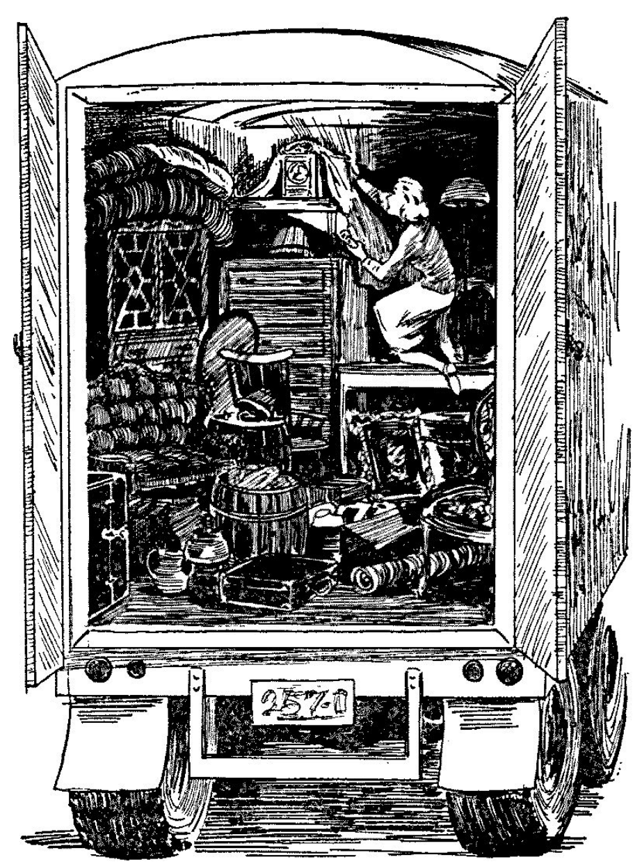
"THE CROWLEY CLOCK AT LAST!" NANCY EXCLAIMED