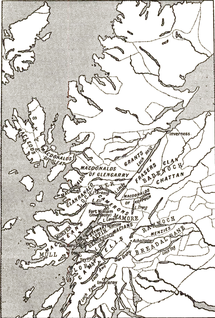
MAP OF THE WESTERN CLANS