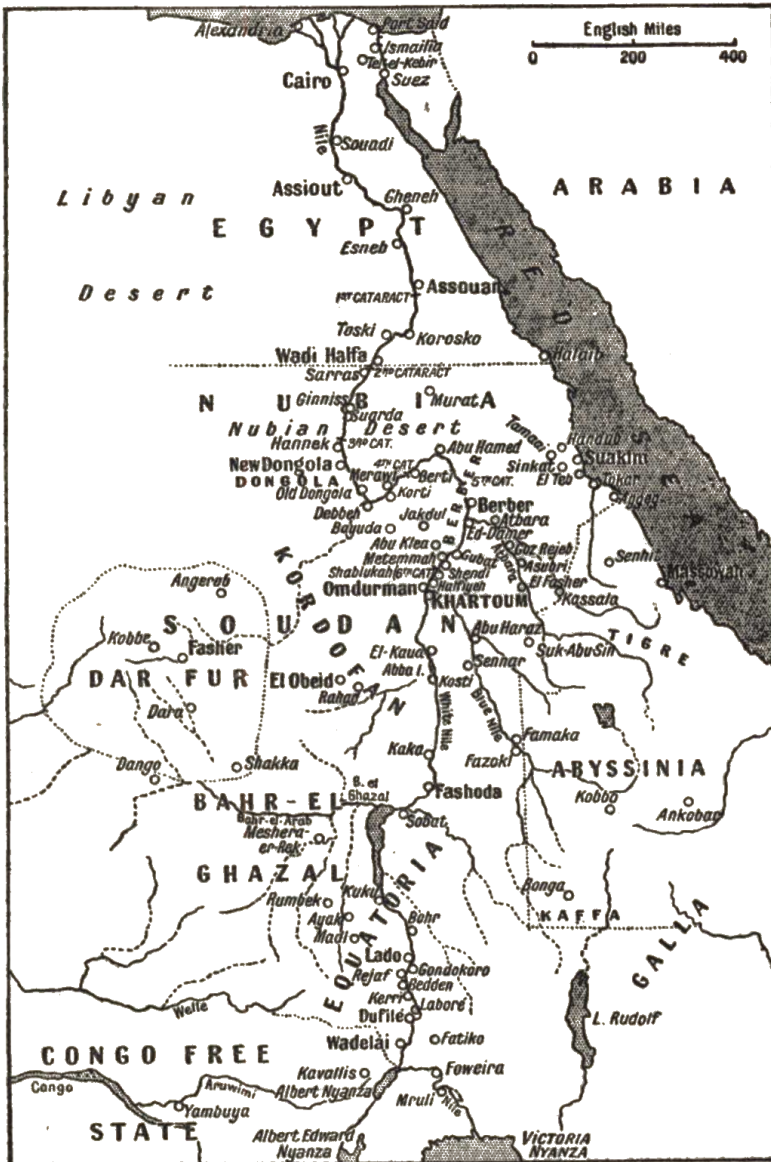
MAP OF THE SUDAN

In 1881 the moment arrived for his epiphany. He cunningly knit up various legends of the Mohammedan world into one. The Twelfth Imam had been long hidden from men: he was the Twelfth Imam. A Messiah had been promised, a Mahdi or 'guide,' who would convert the whole world to the faith of Islam: he was that Mahdi. In May he sent round a proclamation to the neighbouring tribes announcing his advent, and his mission to purify and