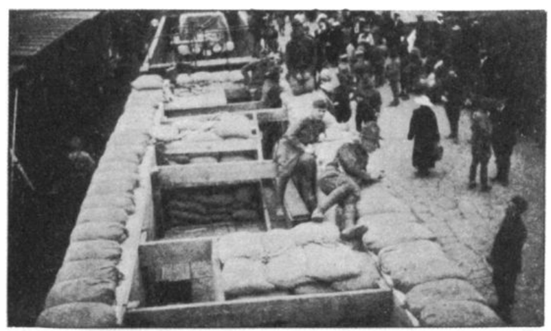
ARMORED CAR—AN EXAMPLE OF AMERICAN INGENUITY TO MEET THE NEEDS OF RAILWAY PATROL