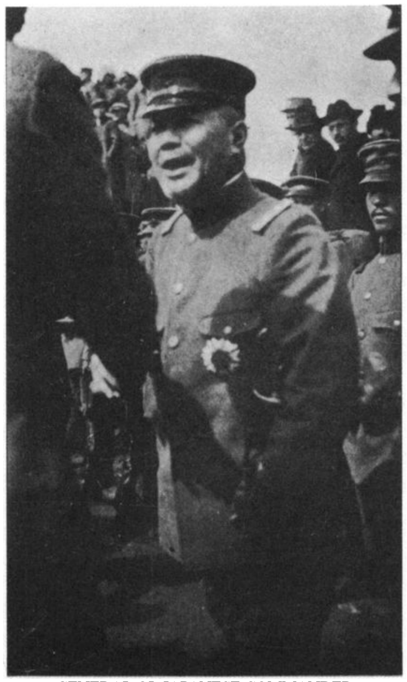
GENERAL OI, JAPANESE COMMANDER

I feel that this statement of my experiences in Siberia would be incomplete without mentioning the American organizations, and individuals