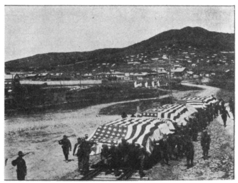
ONE RESULT OF THE RAILWAY AGREEMENT. BODIES OF AMERICAN SOLDIERS KILLED IN ACTION AGAINST ANTI-KOLCHAK FORCES

This did not satisfy the anti-Bolsheviks, so I proposed to withdraw American troops and let them run the mines. This, they knew they could not do. We finally settled on a certain prescribed area wherein I would not