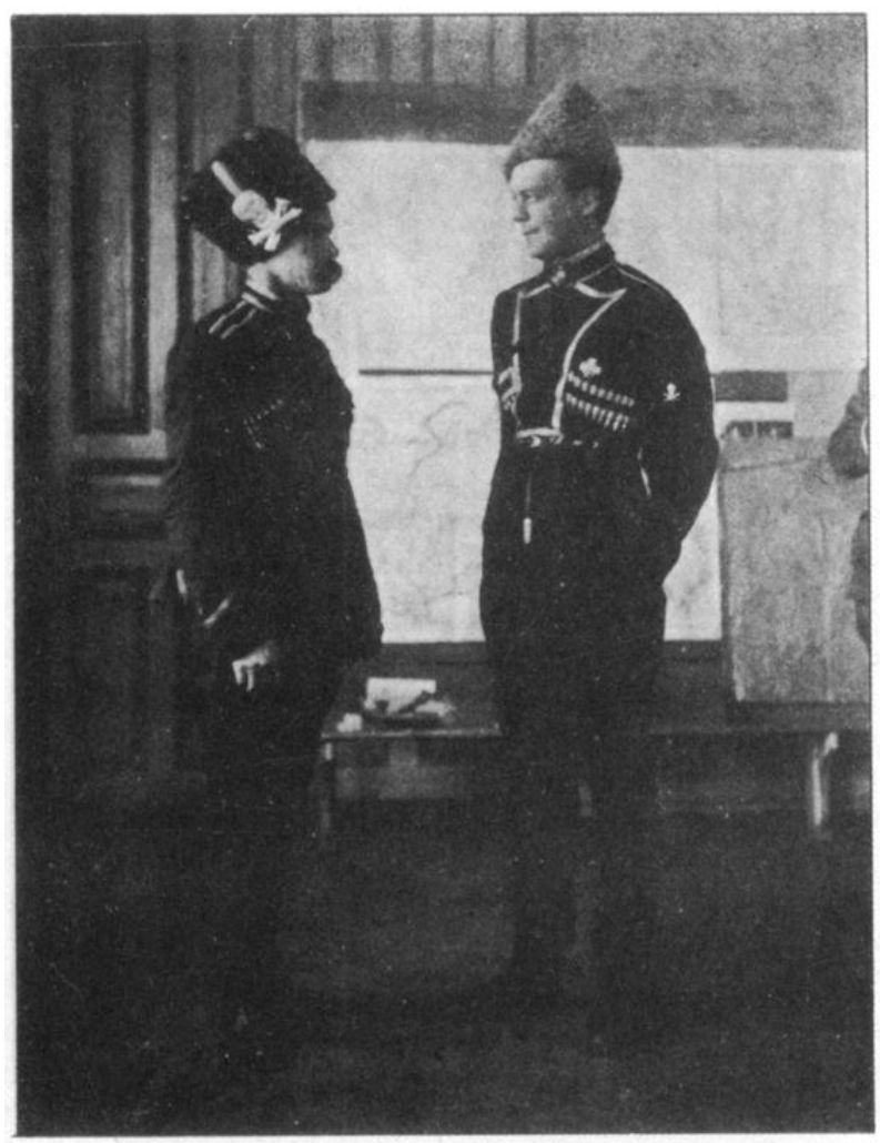
ANNANKOFF, LEADER OF THE SEMIPALATINSK COSSACKS, AND HIS ADJUTANT

reports as these coming from you cannot help but have a tendency to embitter the Omsk Government against the Jews, therefore, I would suggest that in your future telegrams you state only the actual facts."