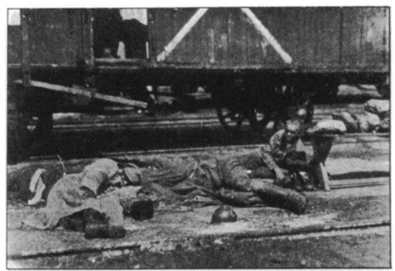
KOLCHAK SICK, NEGLECTED, AND DYING ACROSS THE RIVER FROM OMSK, KOLCHAK'S HEADQUARTERS