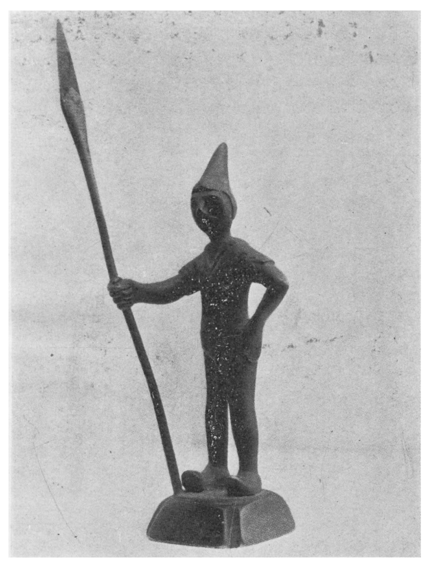
Bronze statue found near Lauterbach

origin—pre-Roman, in short, and indigenous to this country, whence localities like Drusenfluh, Drusenthor, Druseralp, Druserthal.<sup>[25]</sup>