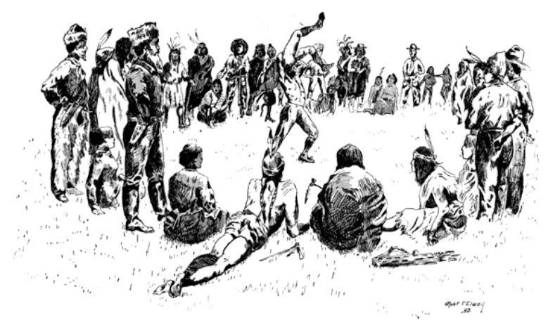
ARCHIE'S LOSS OF SELF-CONTROL THRILLS THE SPECTATORS

Then did Archie lose all control over himself. The wild blood in his veins asserted its presence as it had never done before. A passion of fury seized upon him, so transforming his countenance that his father, catching a glimpse of it as the wrestlers swayed to and fro, felt strongly tempted to rush in and part them. But the thought that his action might be construed to mean over anxiety for his son restrained him.