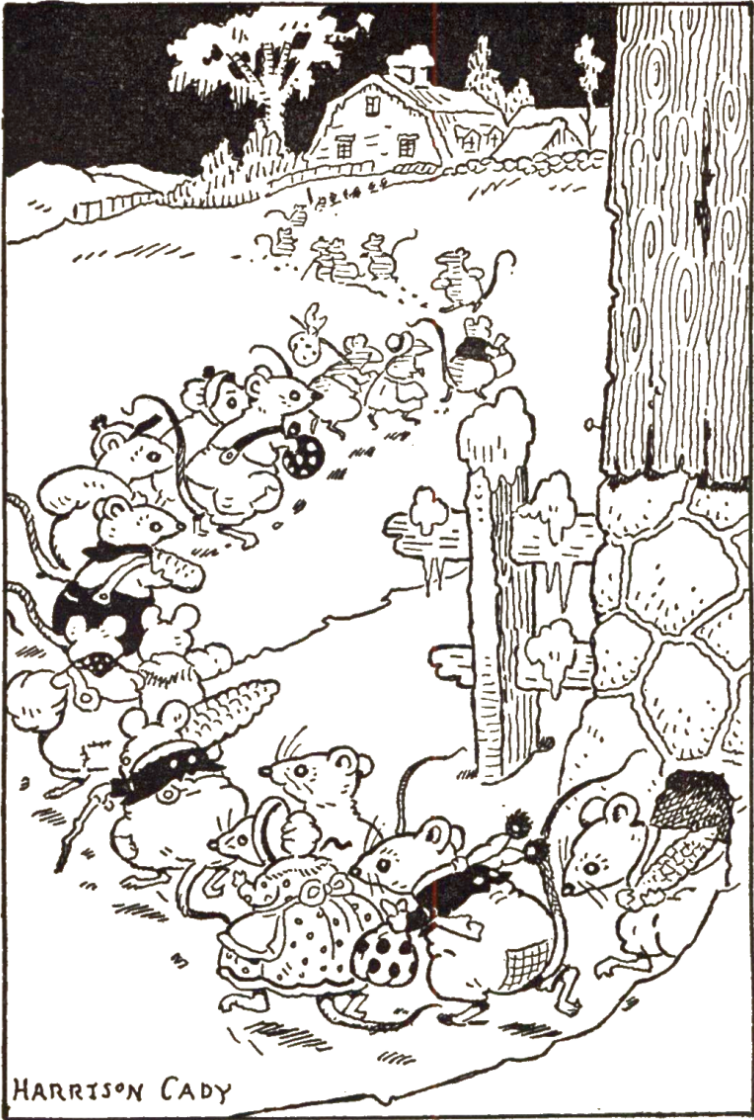
THE RATS LEAVE THE BIG BARN.