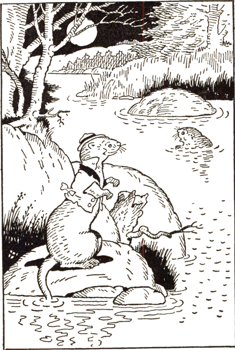
JERRY MUSKRAT WAS SWIMMING OVER TOWARDS HIS HOUSE.

When they reached the Smiling Pool, they saw Little Joe Otter sitting on the Big Rock. Jerry Muskrat was swimming over towards his house.