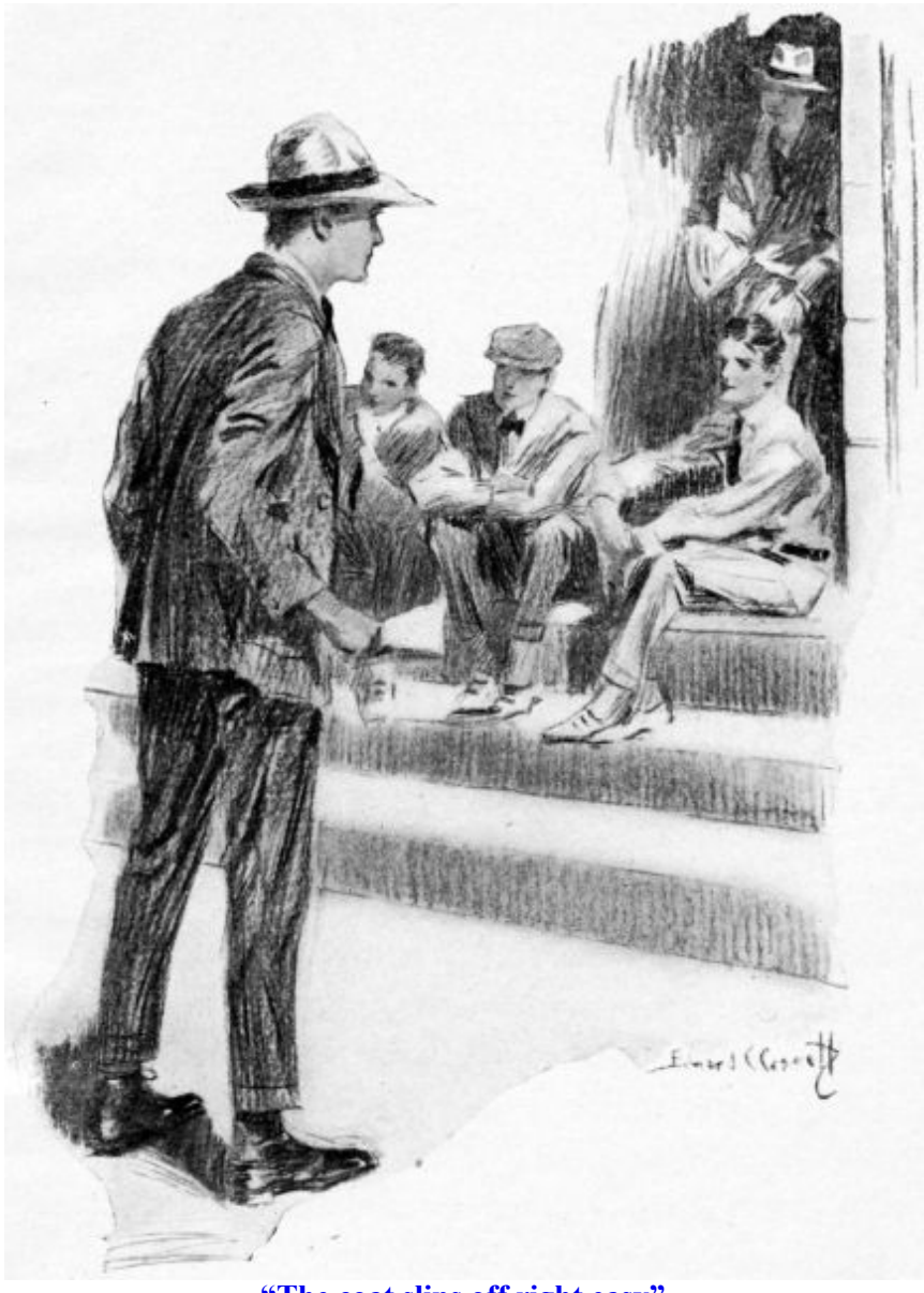
<u>"The coat slips off right easy"</u>

"What do you mean by that?" demanded Gene, jumping to his feet.