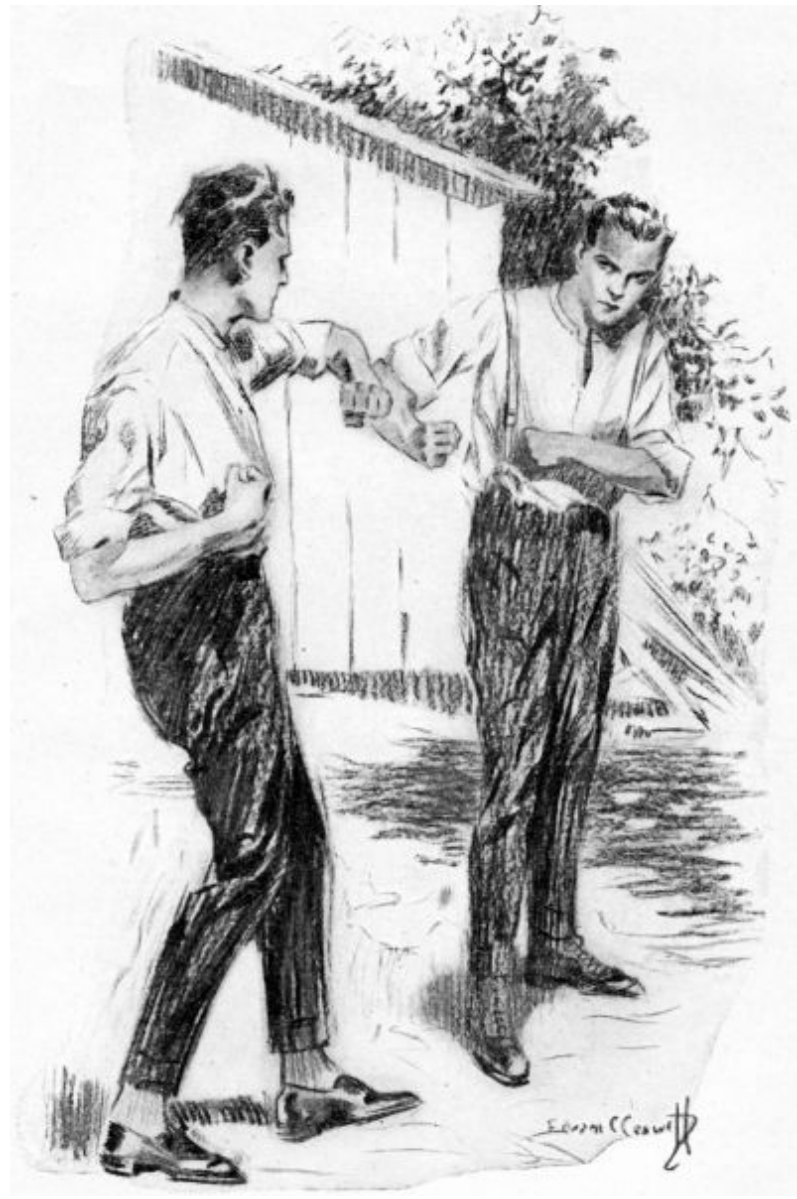
More circling then, each watching the other warily

"This is a perfect farce," declared Goodloe mournfully. "You're not half fighting, confound you!"