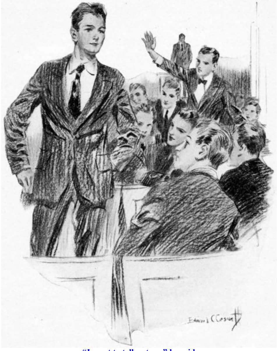
"I want to tell a story," he said

"Naughty! Naughty!" cried a facetious youth.