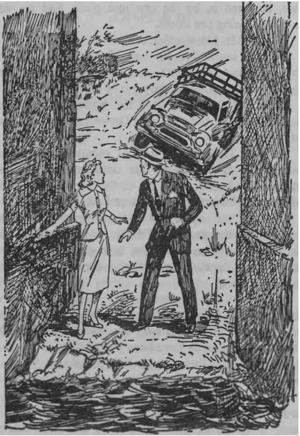
The truck seemed to leap toward them