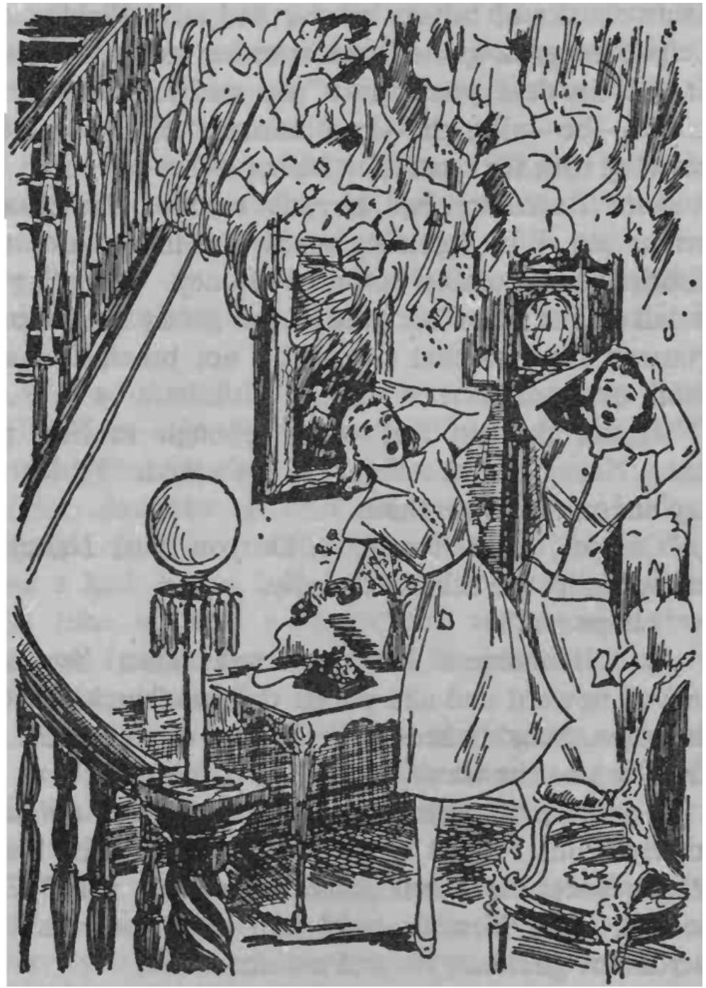
The whole ceiling crashed down on them!