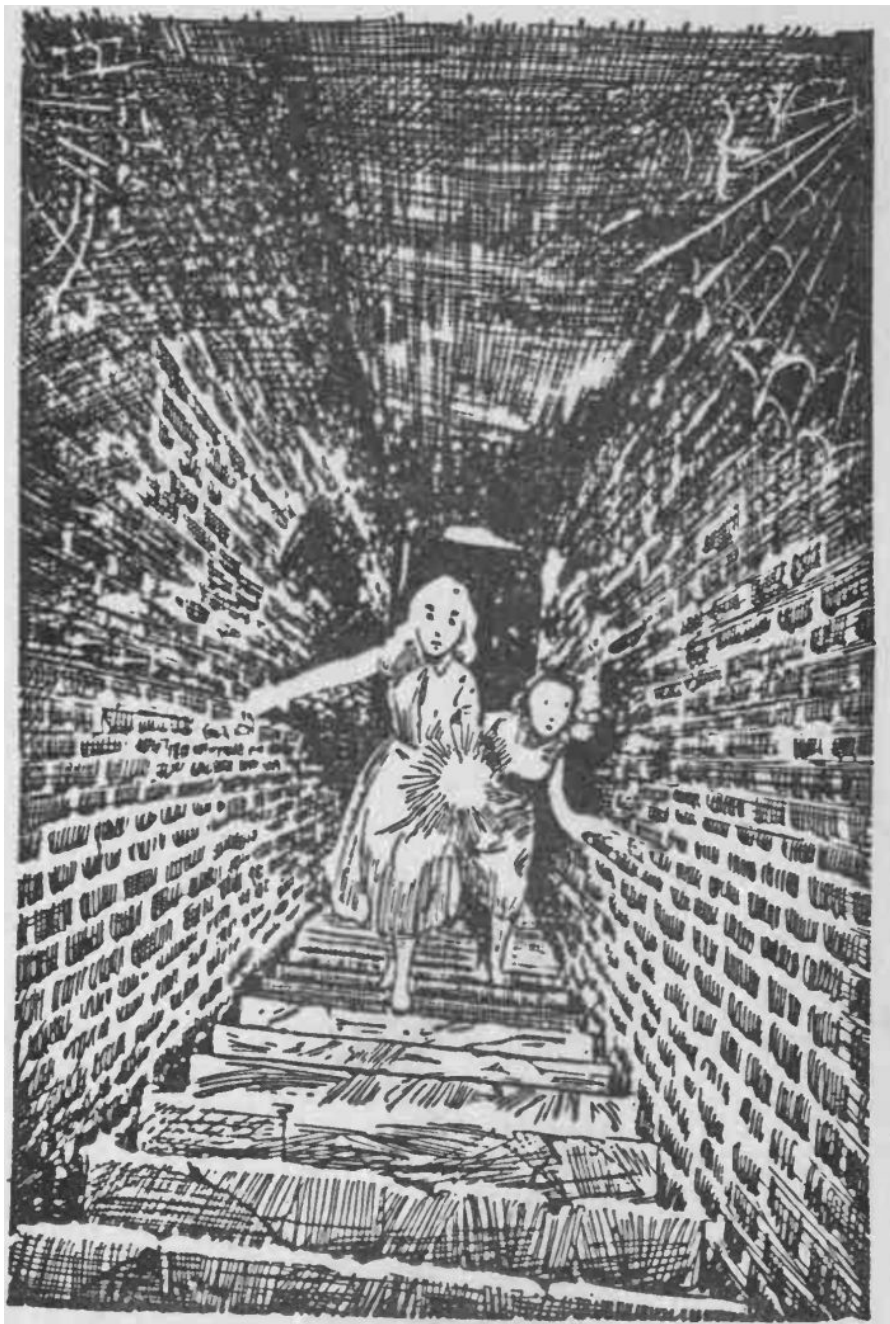
Both girls froze in their tracks