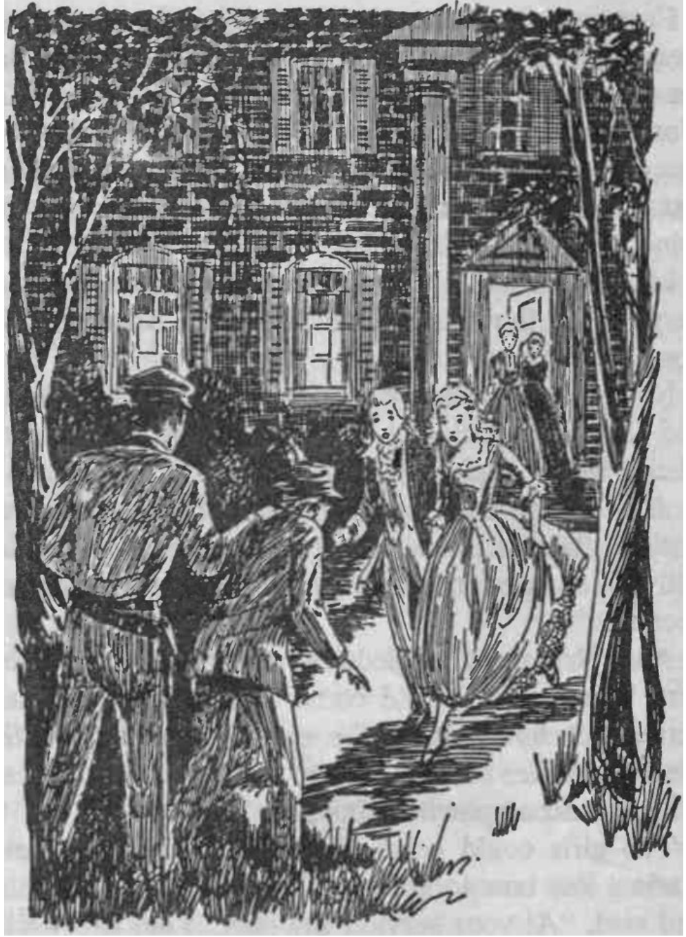
"Is this your ghost?" the police guard asked