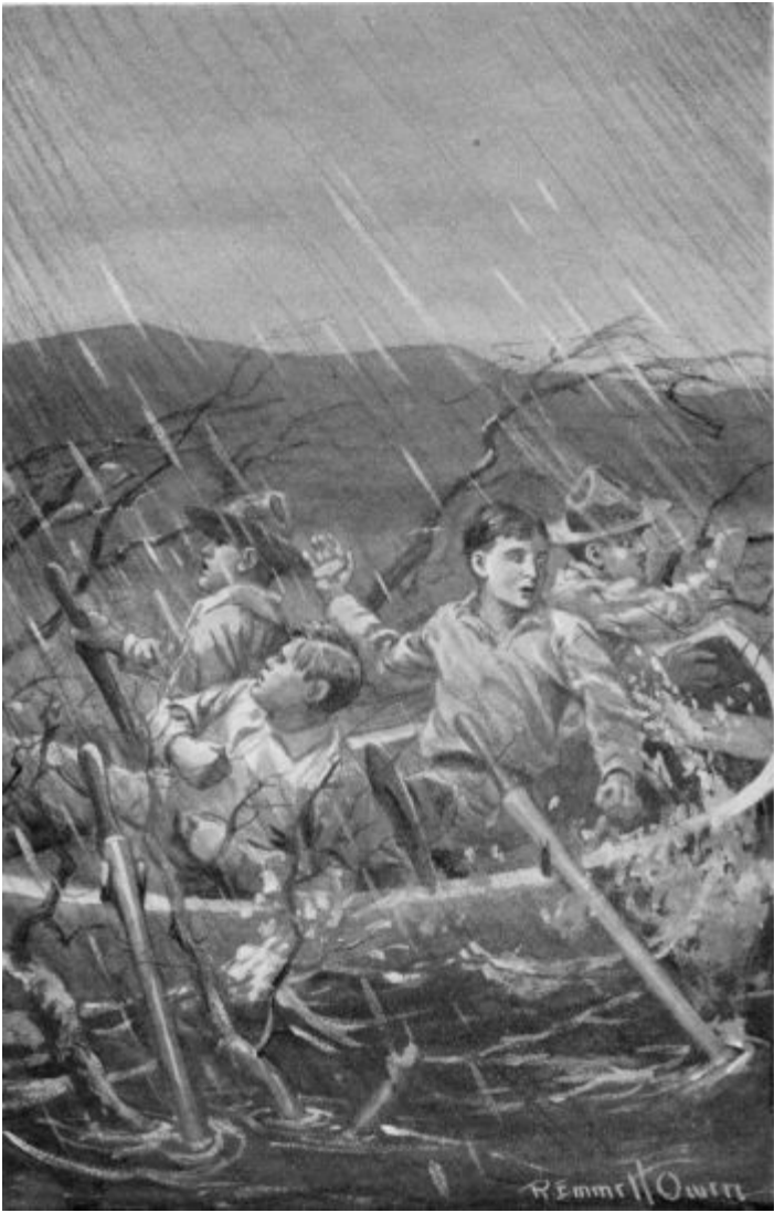
THE TREE POKED ITS BRANCHES UP OUT OF THE BLACK WATER AND GUIDED THEM TO SAFETY.

So it was that that once stately denizen of the lofty forest had paused here to make a last stand against the storm which had uprooted it. So it was that this fallen monarch, friend of the scouts, had contrived to check somewhat the mad rush of water out of their beloved lake, and had guided four of them to safety.