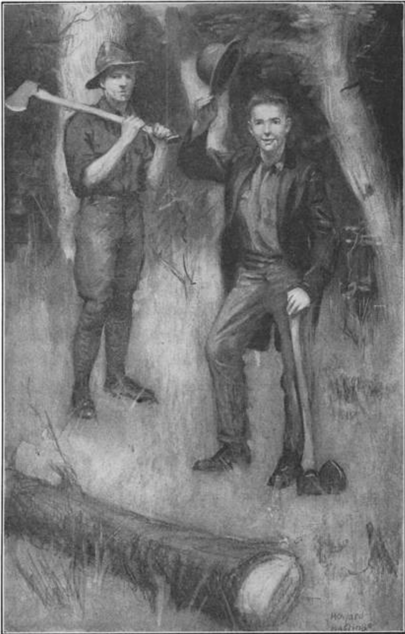
Mr. Fairgreaves appeared with a smile, an axe and a derby hat.

Behind him came the ex-soldier, also shouldering an axe. He wore a threadbare doughboy's suit and a large brimmed slouch hat. He seemed to have a certain humorous appreciation of his companion, yet Tom could not