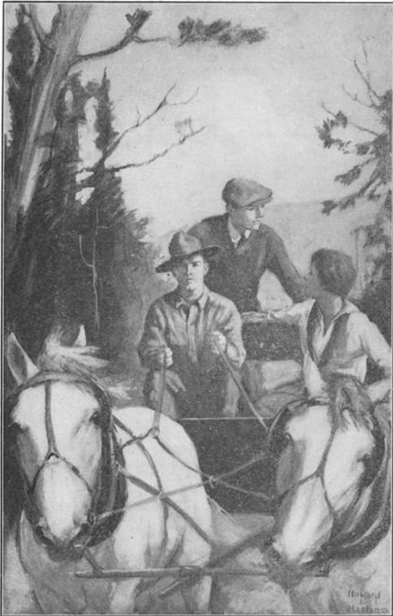
Tom stood up occasionally and chatted with the other two.