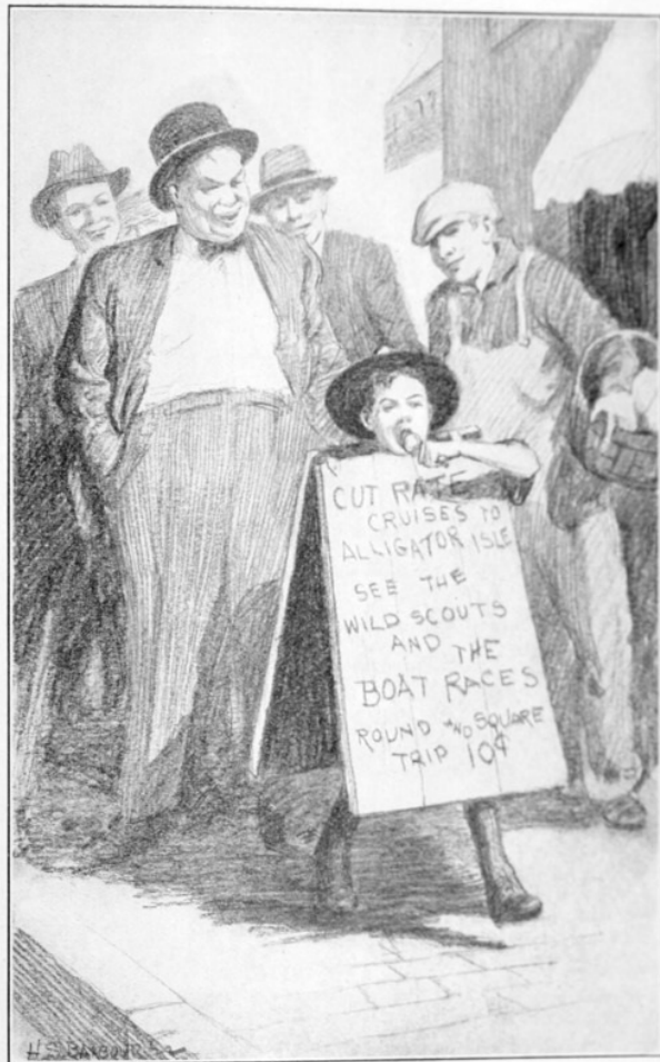
PEE-WEE BECOMES A SANDWICH MAN.