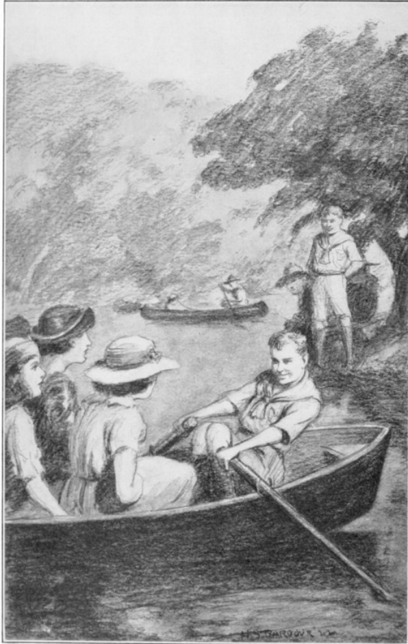
PEE-WEE ROWED HIS CUSTOMERS TO ALLIGATOR ISLAND.