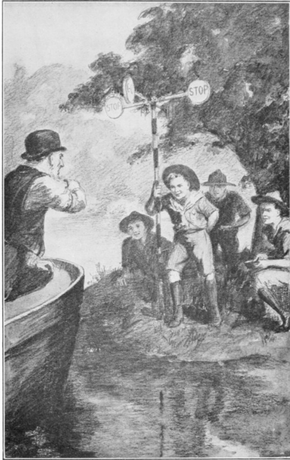
THE BOYS HOLD THE ISLAND IN SPITE OF OLD TRIMMER'S PROTEST.

“Well—what—do—you—know—about—that?” Billy asked incredulously.