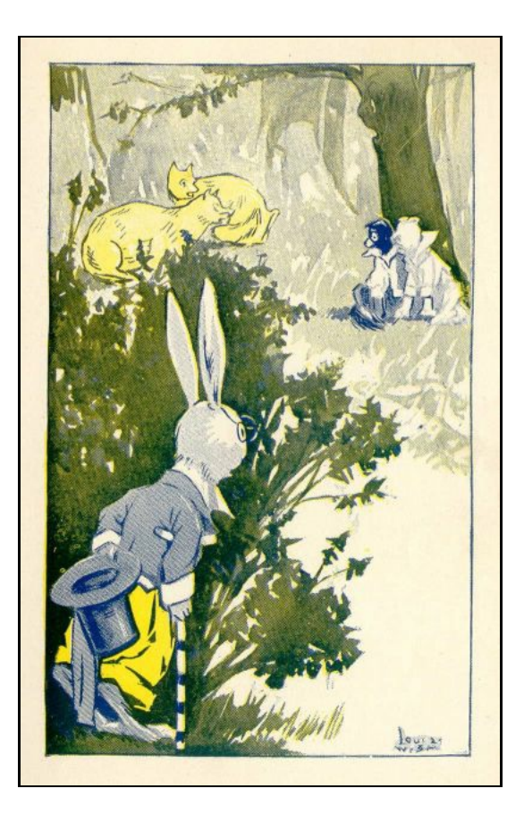
[Illustration: The tree barked and roared so like a lion that the foxes were frightened and were glad enough to run away.]

"Oh, you are welcome," said the tree. "I am the dogwood tree, you know, so why should I not bark and growl to scare foxes, and take care of you little puppy chaps? Come to me again whenever any bad foxes chase you." And Peetie and Jackie said they would.