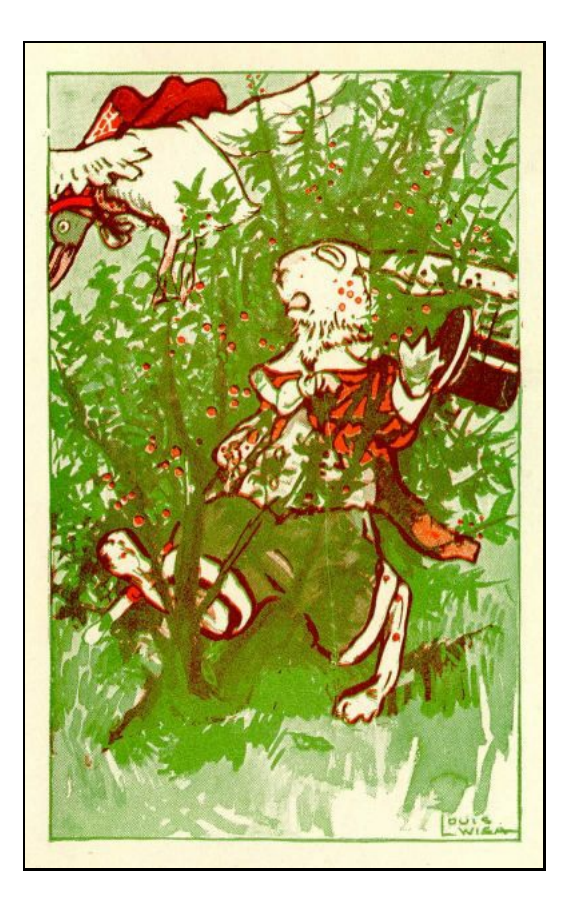
[Illustration: Before Uncle Wiggily could stop himself he had run into the bush.]

But, very luckily, it was not a scratchy briar bush, so no great harm was done, except that Uncle Wiggily's fur was a bit ruffled up, and he was tickled.