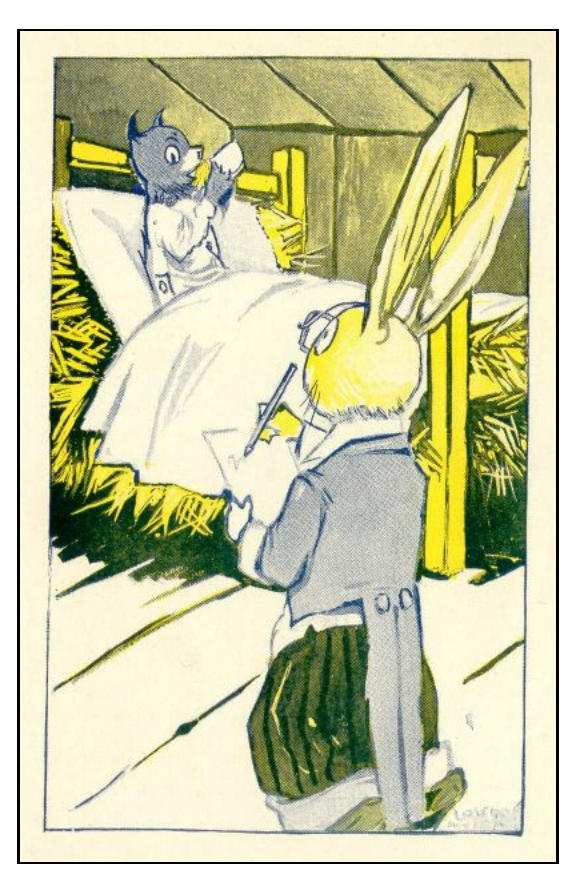
[Illustration: Jackie was so surprised that he opened his mouth.]

Jackie tipped the cup higher, holding it close to his mouth, and threw back his head, and then Uncle Wiggily suddenly cried: "Ouch!" And Jackie was so surprised that he opened his mouth and before he knew it he had swallowed the bitter medicine!