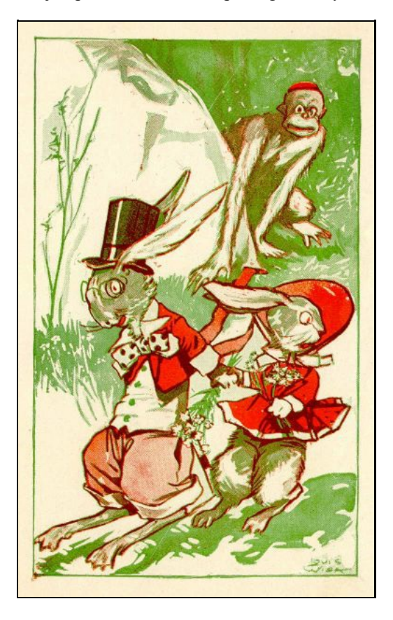
[Illustration: As they passed a high rock, out from behind it jumped the bad old tail-pulling monkey.]

Well, Uncle Wiggily and Susie were going along and along through the woods, when, all of a sudden, as they passed a high rock, out from behind it jumped the bad old tail-pulling monkey.