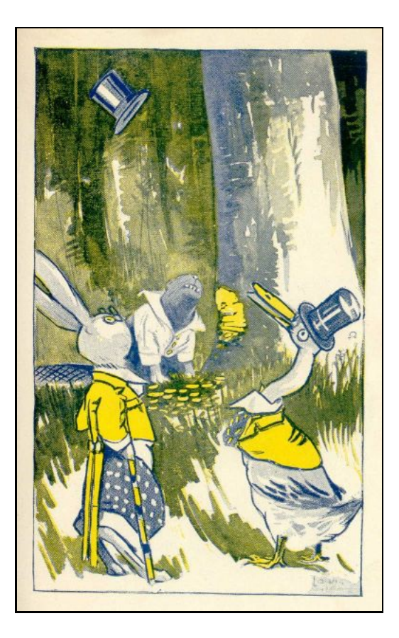
[Illustration: Down toppled Uncle Wiggily's hat, not in the least hurt.]

And if the little mouse doesn't go to sleep in the cat's cradle and scare poor pussy so her tail swells up like a balloon, I'll tell you next about Uncle Wiggily and the peppermint.