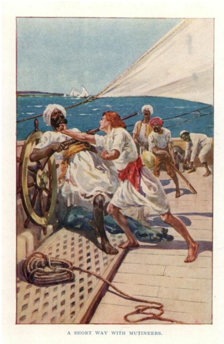
A SHORT WAY WITH MUTINEERS.

Meanwhile the crew had looked on for a few breathless moments in amazement at this sudden turn of affairs. But as the Gujarati fell Desmond heard a noise behind him. Half turning, he saw Shaik Abdullah rushing towards him with a marlinspike. The man had him at a disadvantage, for he was breathless from his tussle with Fuzl Khan; but at that moment a dark object hurtled through the air, striking this new antagonist at the back of the head, and hurling him a lifeless lump into the scuppers. Desmond looked round in wonderment: who among the crew had thus befriended him so opportunely? His wonder was not lessened when he saw the Babu, trembling like a leaf, his eyes blazing, his dusky face indescribably changed. At the sight of Desmond's peril the Bengali, forgetting his weakness, exalted above his timidity, had caught up with both hands a round nine-pounder shot that lay on deck, and in a sudden strength of fury had hurled it at the Biluchi. His aim was fatally true; the man was killed on the spot.