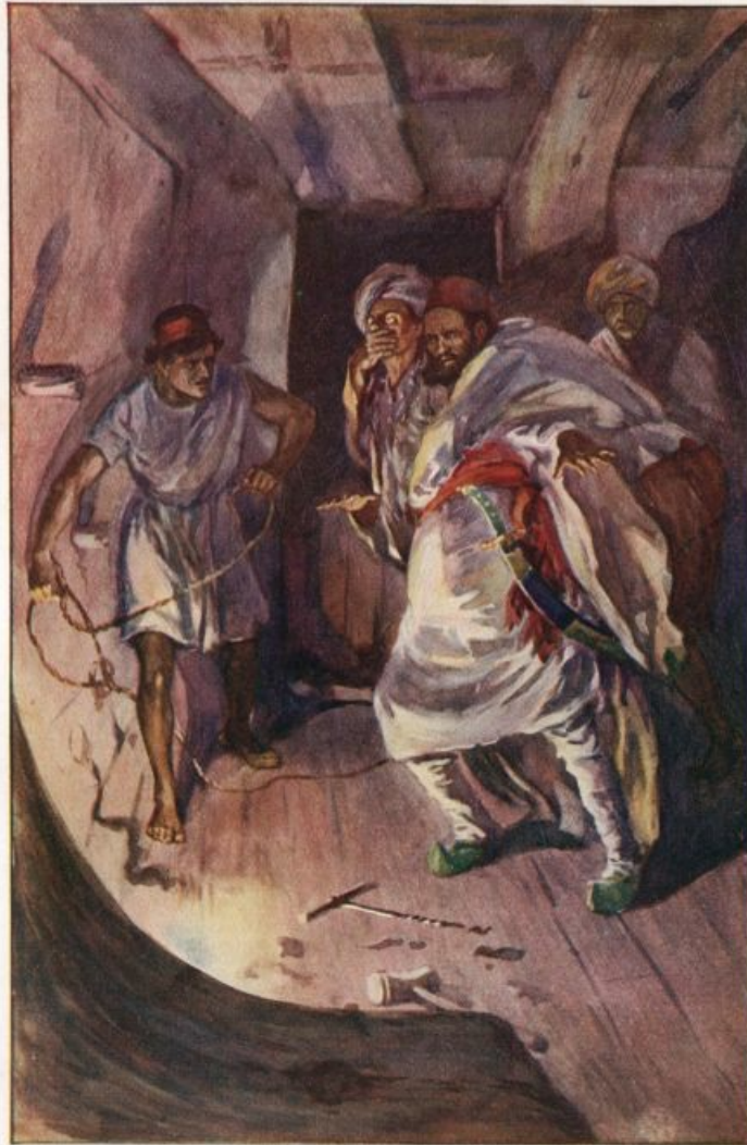
THE SUBAHDAR FALLS INTO THE TRAP.