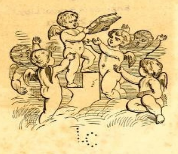
BOSTON: TICKNOR AND FIELDS, 124 TREMONT STREET.