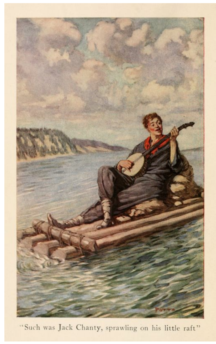
"Such was Jack Chanty, sprawling on his little raft"