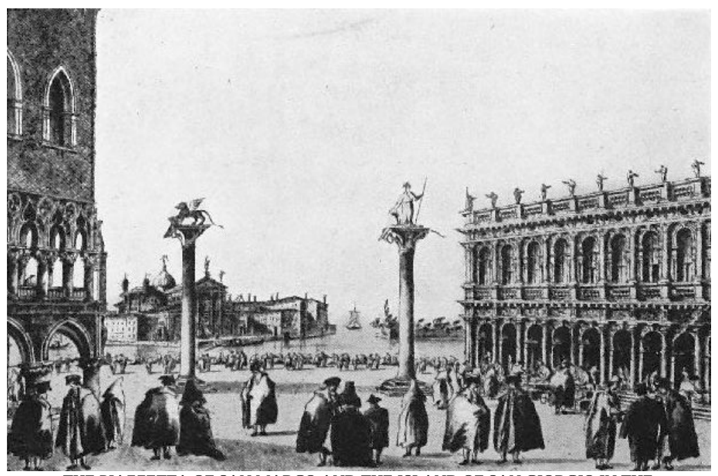
THE PIAZZETTA OF SAN MARCO AND THE ISLAND OF SAN GIORGIO IN THE TIME OF GOLDONI

From a painting by Francesco Guardi in the Correr Museum, Venice