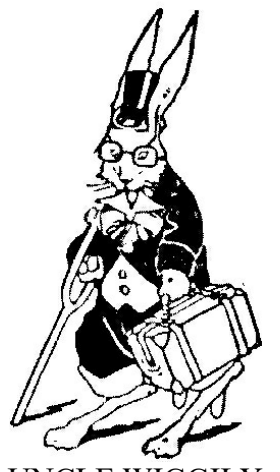
UNCLE WIGGILY Reg. U. S. Pat. Off.