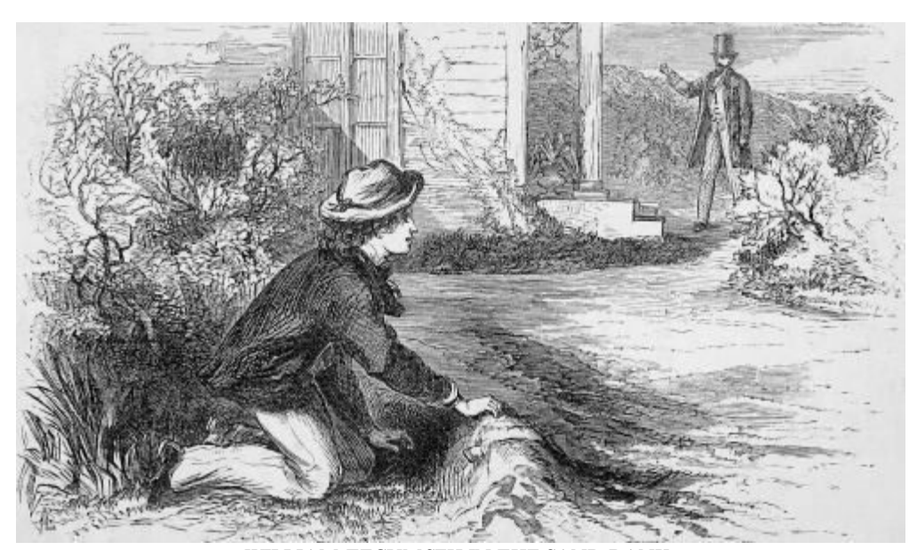
WILLIAM TECUMSEH IN THE SAND BANK.