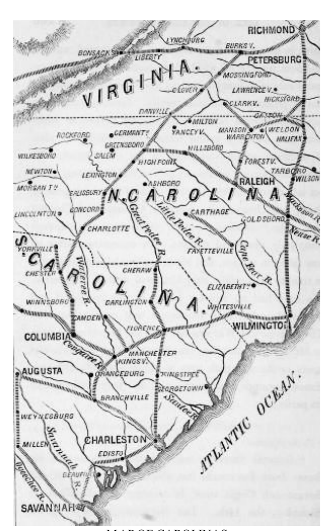
MAP OF CAROLINAS