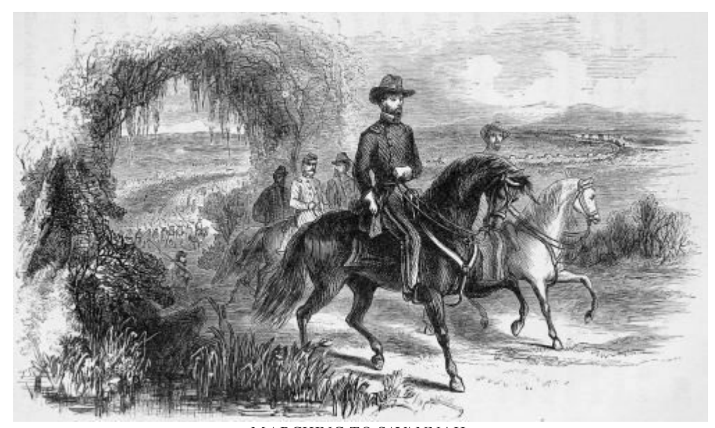
MARCHING TO SAVANNAH.

On the 10th, when the evening darkened around the beautiful Rome of Georgia, the heavens glowed with its conflagration. A fearful storm had ceased, the advance was at hand, and it was necessary, in the stern demands of war, to make a torch and desolation of that place, in the wake of the march. The fire was kindled by General Corse, according to the orders of the commander. A spectator wrote of the scenes of that terrific conflagration: