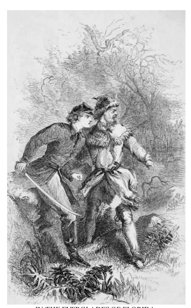
IN THE EVERGLADES OF FLORIDA.