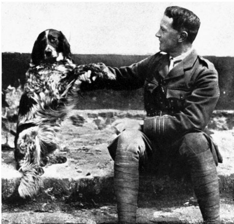
John McCrae and Bonneau