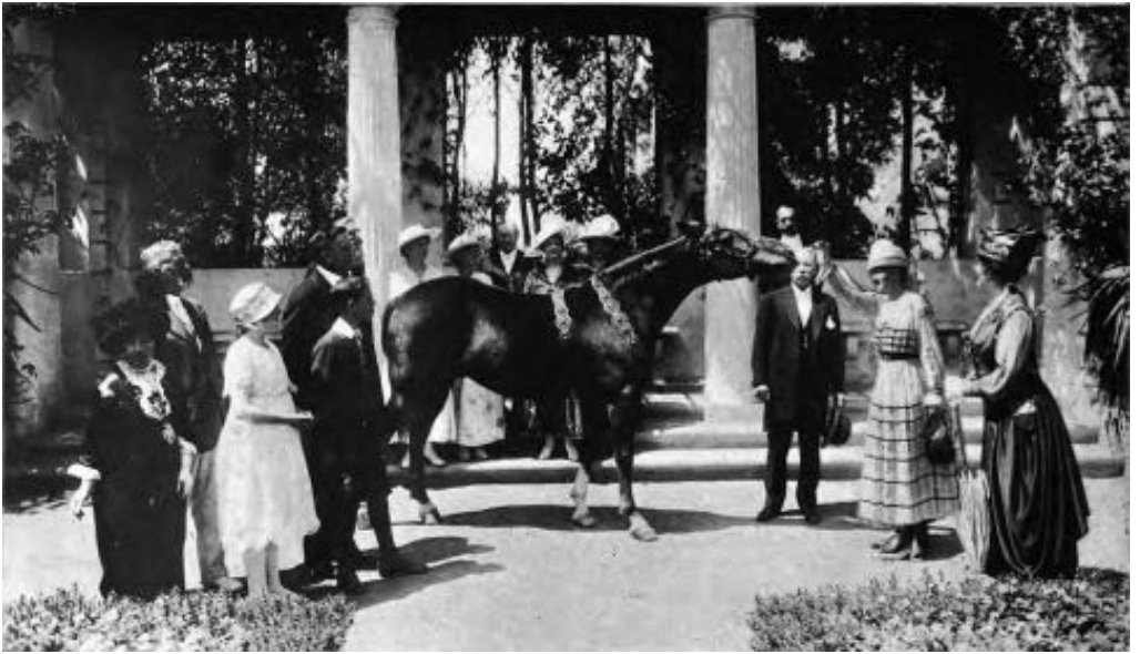
Ellen Beach Yaw, "Lark Ellen" of California, Singing to Captain at the San Diego Exposition.