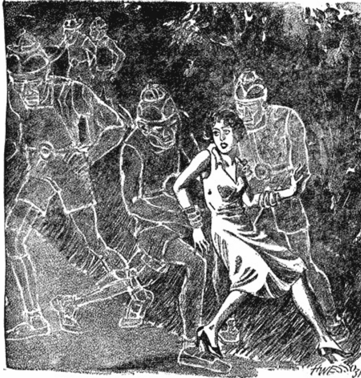
I fired at an oncoming white figure.

Don gripped the colored boy whose coffee complexion had taken on a greenish cast with his terror.