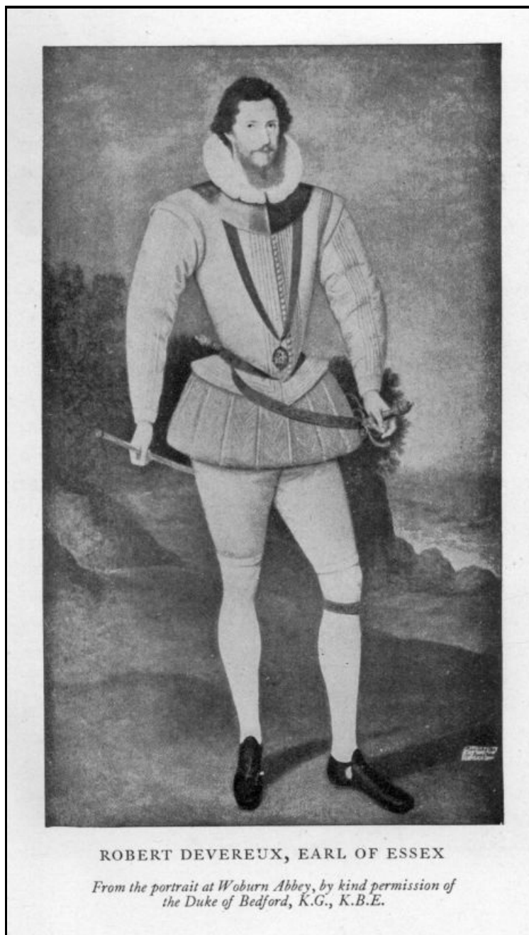
ROBERT DEVEREUX, EARL OF ESSEX.