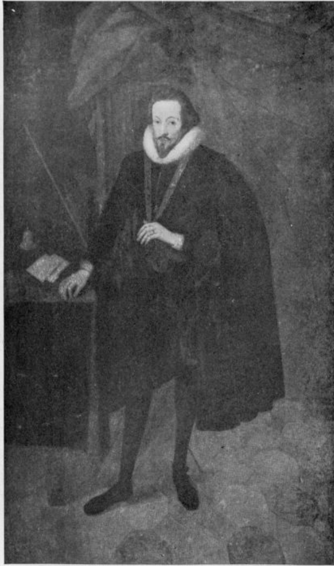
ROBERT CECIL, EARL OF SALISBURY

From the portrait at Woburn Abbey, by kind permission of the Duke of Bedford, K.G., K.B.E.