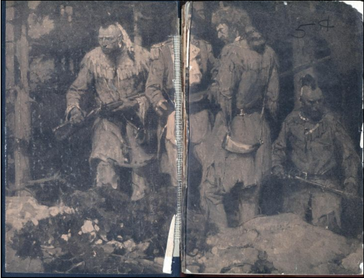
End of The Plains of Abraham by James Oliver Curwood]