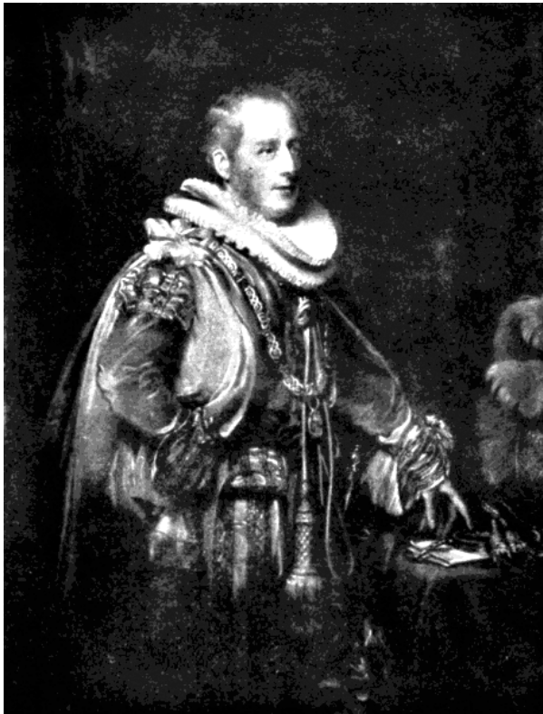
SIR CHARLES BAGOT

From an engraving in the Dominion Archives.