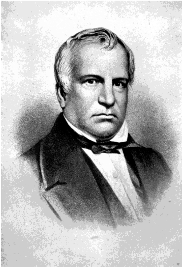
SIR LOUIS H. LAFONTAINE

value. The leaders of the British party were sincere in their belief that the success of this measure meant the triumph of the French and the reversal of all that had been done to hold the colonies for the Empire against rebels whose avowed purpose was separation. Twelve years had gone by since they had failed in the overt act. Now Papineau was back in the House, about to receive his arrears of salary as Speaker. In Elgin's eyes he was a Guy Fawkes waving flaming brands among all sorts of combustibles. Mackenzie, like the others, had been granted amnesty and was about to return to Canada. Wolfred Nelson, who had resisted Her Majesty's forces at St Denis, was to have his claim for damages considered. It was not in the flesh and blood of politicians to endure all this; and before condemning the opposition to this bill, as is the fashion with Canadian historians, we might ask what we should have done ourselves in such circumstances. What the Tories did was to raise the war-cry, 'No pay to rebels.' It resounded from one end of the province to the other and roused to life all the passion that had slumbered since the rebellion.