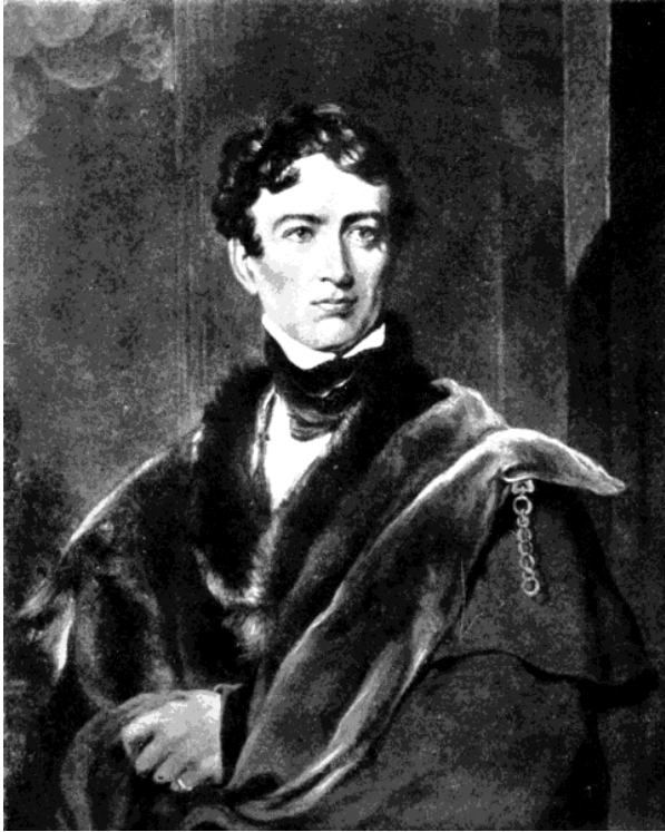
THE EARL OF DURHAM

was the physician chosen by the British government to cure the cankers of misrule and disaffection in the body politic of Canada.