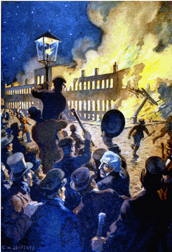
BURNING OF THE PARLIAMENT BUILDINGS, MONTREAL, 1849 From a colour drawing by C. W. Jefferys.