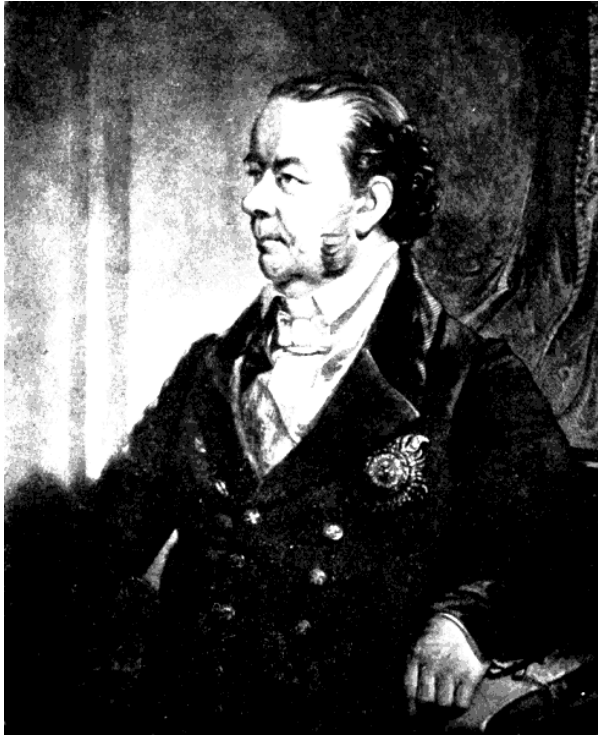
SIR CHARLES METCALFE After a painting by Bradish.

more than his official salary in the various ways a governor-general is expected to bestow largesse. His 'jolly visage' bore the marks of a cruel and incurable disease. He is still remembered in India as the author of the bill which established the freedom of the press. The historian Macaulay calls him 'the ablest civil servant I ever knew in India.' Durham, Sydenham, Bagot, Metcalfe--Britain had few more distinguished or more able servants of the state; and they devoted all their powers, without a thought of the cost to themselves, to solving a vital problem in the maintenance of the Empire. Their more obvious rewards were obloquy and death.