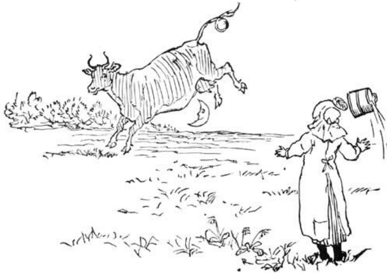
The Cow jumped over the Moon,