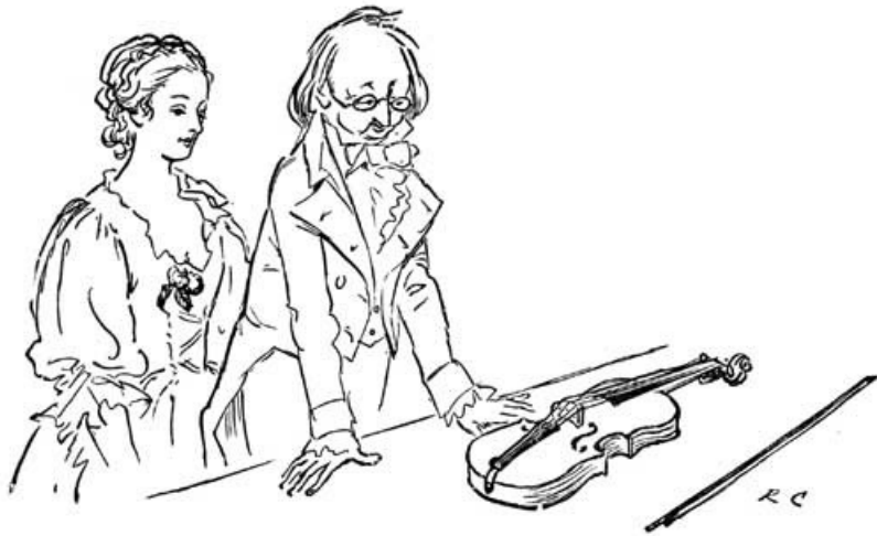
and the Fiddle,