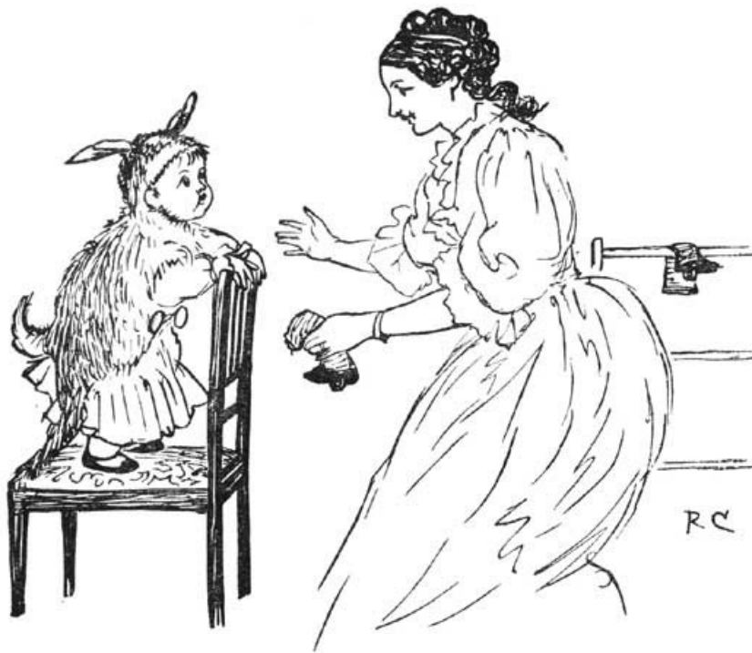
To wrap the Baby Bunting in.