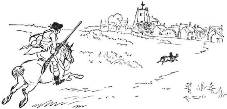
Gone to fetch