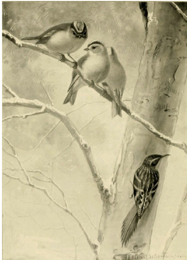
THE GOLDEN-CROWNED KINGLET AND BROWN CREEPER

The Butcher Bird has often been persecuted for the destruction of smaller birds; it seems far wiser to protect it, not only in order to preserve so interesting a bird, but because birds form so small a per cent of its food. In the spring and fall, it lives very largely on insects, and throughout the winter, mice form a large part of its diet. There is always danger of blundering when man interferes in the concerns of nature, and if he once exterminates any creature, it is beyond his power to re-create it.