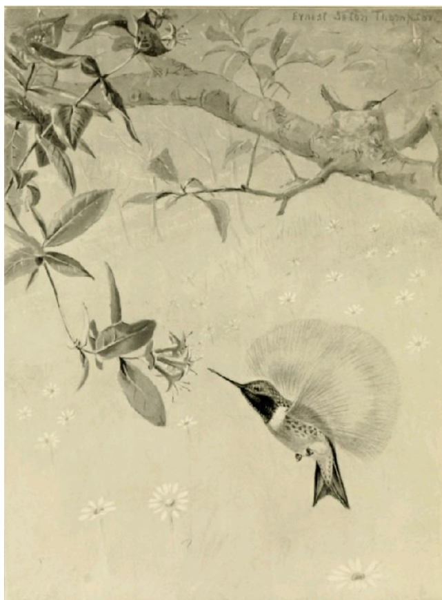
THE RUBY-THROATED HUMMING-BIRD

The Redstart comes early in May and stays through the summer. Some are seen even as late as October, but these are, very likely, birds which have bred far North, where the late summer did not permit them to rear their young so early as our own birds.