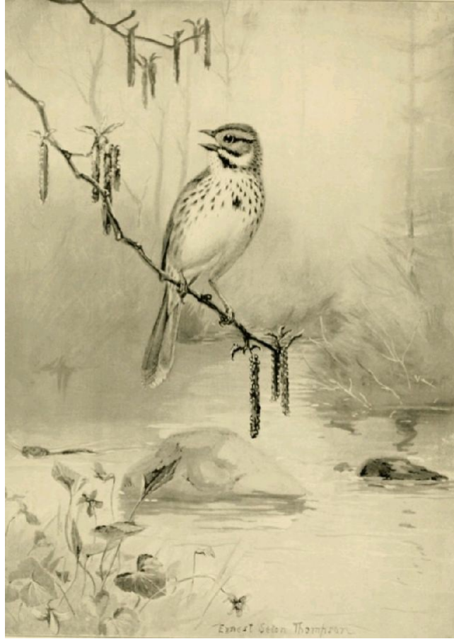
THE SONG SPARROW