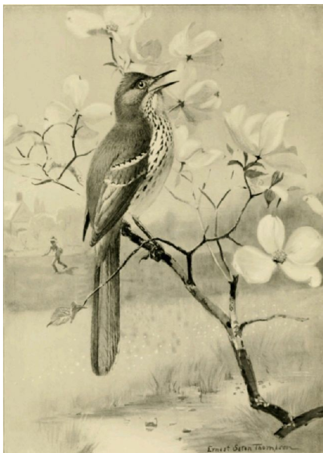
THE BROWN THRASHER

The Flicker, though not known to raise a second brood, has a second period of song, so that we hear again in June the shout, or mating call, of the early spring days. Besides this high-pitched wick, wick, wick , the Flicker utters, when startled, a curious note like worroo ; a sharp ti'ou is the call to its kind, and the syllables yucker, yucker , often accompanied by ludicrous bowing with wings and tail outspread, are used to show affection.