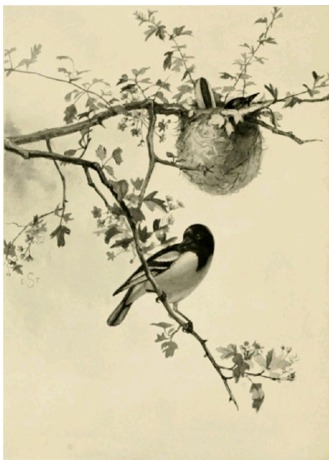
THE BALTIMORE ORIOLE

The Kingbird has often been accused of destroying honeybees. Even allowing that individuals occasionally do some damage in this way, the good services of the race in destroying harmful insects far outweigh these injuries, and the remedy is to drive the bird away from the hives, not to kill it.