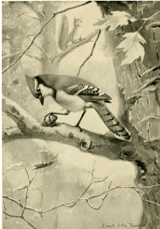
THE BLUE JAY

No bird has livelier, more cheerful ways than our Goldfinch, and none becomes a greater favorite. People are often at considerable pains to remove the dandelion plants from their lawns; if the gay flowers themselves do not repay one for their presence, many would certainly allow them to remain in order to have the pleasant spectacle, in summer, of a flock of yellow Goldfinches scattered about the grass and feeding on the seeds.