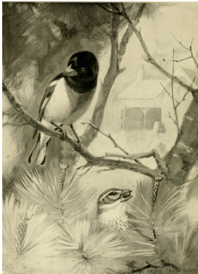
THE ROSE-BREASTED GROSBEAK

Tanagers arrive early in May, and may then be easily observed, as the trees are not yet in full leaf. Occasionally, in cold storms, all birds seem to keep near the ground, and on such occasions Tanagers are sometimes seen feeding on the ground itself, their splendid colors showing to wonderful advantage. The female is a very plain personage. Olive green above and greenish yellow below, with dull brownish wings, is a combination of color that serves very well to keep her concealed among the leaves. The nest is sometimes placed in orchard trees or even in low bushes, but frequently in tall oaks. It is loosely built of straw and twigs, and contains, by the end of May, from three to four eggs of a light greenish blue, marked with brown and lilac. The young are fed on insects gathered from the leaves. By the end of the summer, the male moults his bright red feathers and comes out in a suit resembling that of the female, but he keeps his black wings and tail. The whole family, clothed in these inconspicuous colors, migrate southward and remain in the tropics till the following spring.