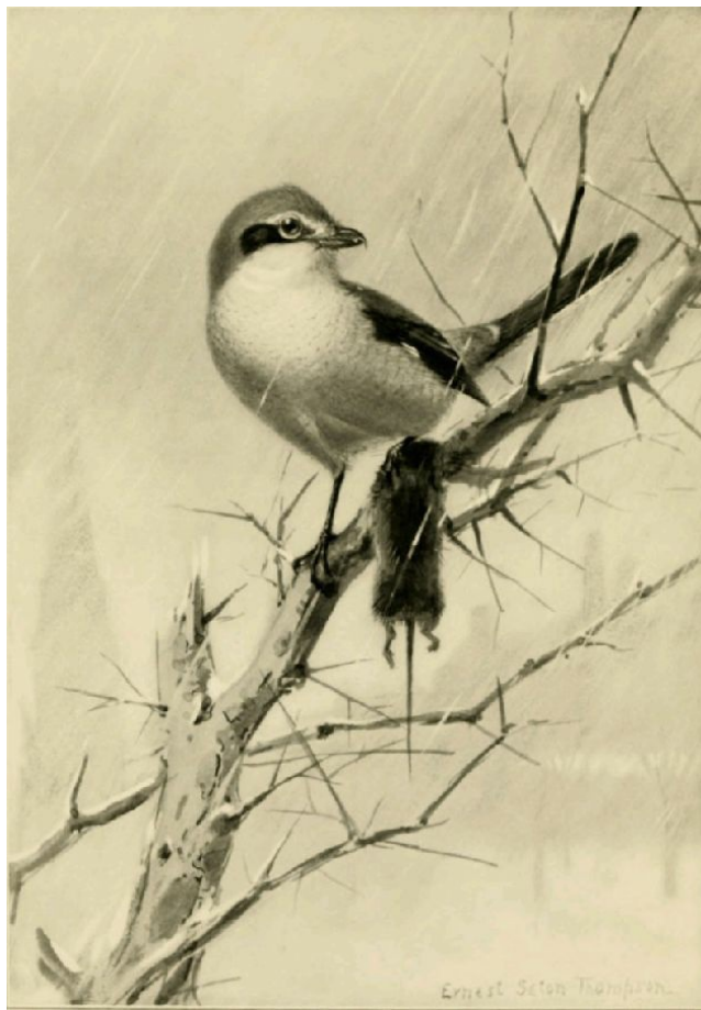
THE BUTCHER BIRD