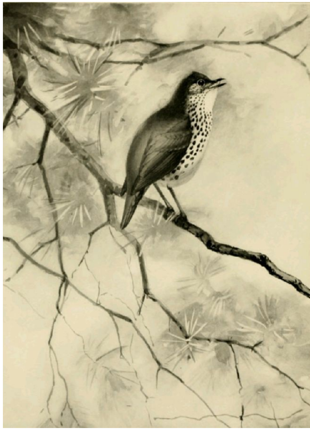
THE WOOD THRUSH