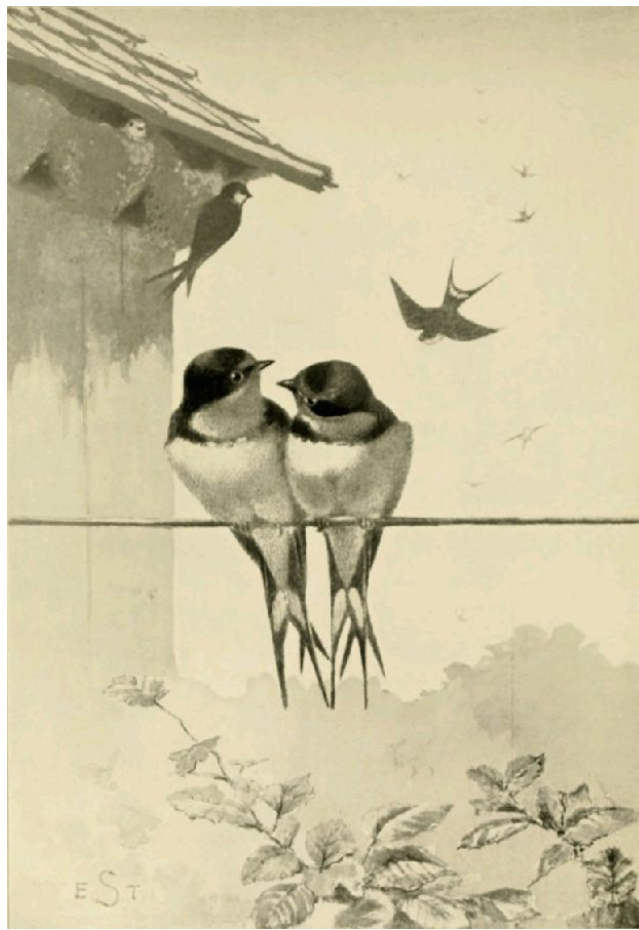
THE BARN SWALLOW