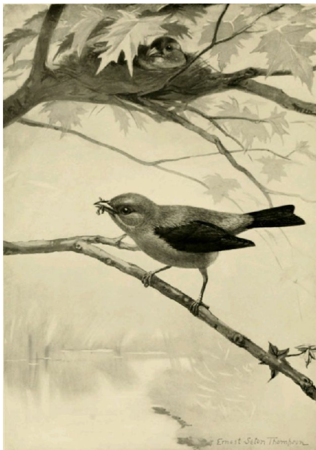
THE SCARLET TANAGER

While the female is brooding the eggs, the male may be heard day after day from some favorite perch, not too near the nest. The early morning and the late afternoon are the favorite times for all the Thrushes, but on cloudy days or in the cool shades of deep woods, they sing all day. Occasionally the song ceases for several days. Some calamity has befallen the nest; a squirrel or some other marauder has robbed the pair, and there are no more outpourings of joy, till with renewed courage they select some safer spot and build again. In midsummer, the Thrushes become very silent. Occasionally we come upon a group feeding in the cherry or viburnum bushes, but few are seen after August, and by November they are in the tropics. Only the nest filled with snow reminds us of the pair, whose return in May we await with impatience.