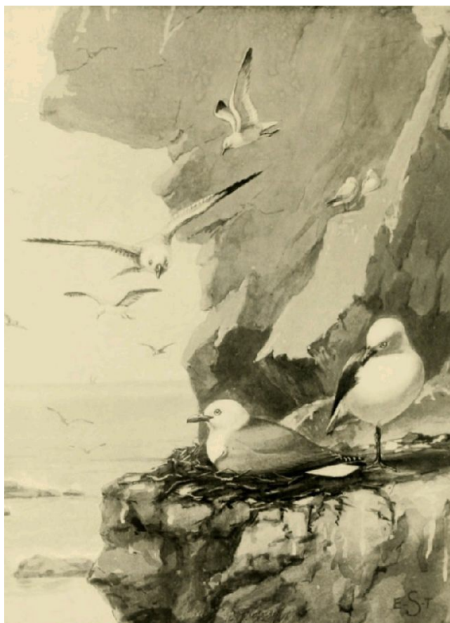
THE HERRING GULL

Like some of the Warbler family, the Kinglet does not let an insect escape, though it should take wing before it could be seized. The bird, too, has wings, and darts out after its prey. In winter, it often hovers under the piazza roofs, or the lintels of the barn door, and while in the air, picks off the eggs or chrysalids that have been hidden in the crevices. Occasionally one of the birds, in its eagerness to seize some attractive morsel, flies sharply against a windowpane. No doubt it is the part of a thrifty householder to sweep out the insects from his piazza roof, but there are some, like Lowell, wise enough to leave a few decayed limbs on their apple trees for the Woodpeckers, a patch or so of weeds for the Snowbirds, and a chrysalis or two for the hungry Kinglets in winter.