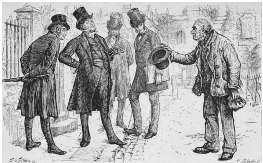
DURKLES CAUTIONS MR. SAPSEA AGAINST BOASTING.

Durdles then gives the Dean a good evening, and adding, as he puts his hat on, "You'll find me at home, Mister Jarsper, as agreed, when you want me; I'm a going home to clean myself," soon slouches out of sight. This going home to clean himself is one of the man's incomprehensible compromises with inexorable facts; he, and his hat, and his boots, and his clothes, never showing any trace of cleaning, but being uniformly in one condition of dust and grit.