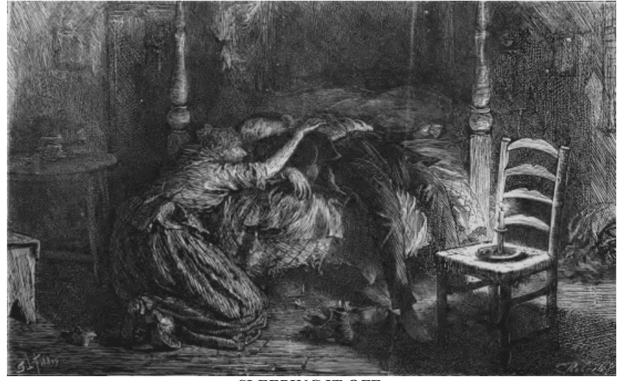
SLEEPING IT OFF.

Unwinking, cat-like, and intent, she presently adds: "Not so potent as it once was? Ah! Perhaps not at first. You may be more right there. Practice makes perfect. I may have learned the secret how to make ye talk, deary."