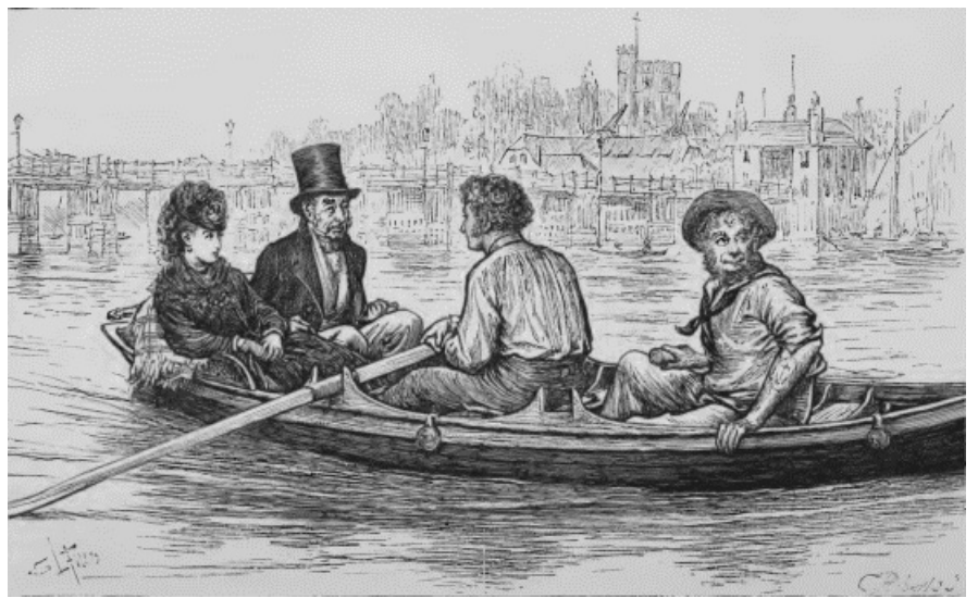
UP THE RIVER.

Miss Twinkleton brought a quantity of luggage with her, having all Rosa's as well as her own. The Billickin took it ill that Miss Twinkleton's mind, being sorely disturbed by this luggage, failed to take in her personal identity with that clearness of perception which was due to its demands. Stateliness mounted her gloomy throne upon the Billickin's brow in consequence. And when Miss Twinkleton, in agitation taking stock of her trunks and packages, of which she had seventeen, particularly counted in the Billickin herself as number eleven, the B found it necessary to repudiate.