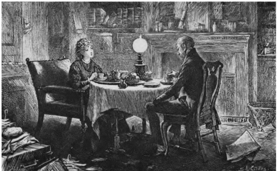
MR. GREWGIOUS EXPERIENCES A NEW SENSATION.

"He bears up against it with commendable fortitude if he is," returned Mr. Grewgious, after considering the matter. "But I doubt if he is. Not particularly so. You see, he is discontented, poor fellow."