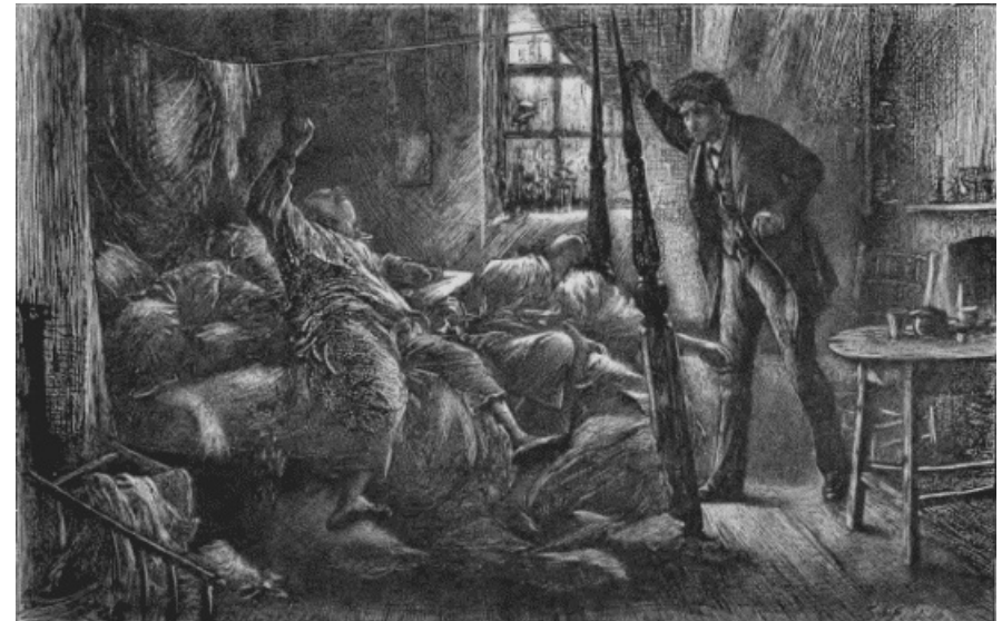
IN THE COURT

Shaking from head to foot, the man whose scattered consciousness has thus fantastically pieced itself together, at length rises, supports his trembling frame upon his arms, and looks around. He is in the meanest and closest of small rooms. Through the ragged window-curtain, the light of early day steals in from a miserable court. He lies, dressed, across a large unseemly bed, upon a bedstead that has indeed given way under the weight upon it. Lying, also dressed and also across the bed, not longwise, are a Chinaman, a Lascar, and a haggard woman. The two first are in a sleep or stupor; the last is blowing at a kind of pipe, to kindle it. And as she blows, and shading it with her lean hand, concentrates its red spark of light, it serves in the dim morning as a lamp to show him what he sees of her.