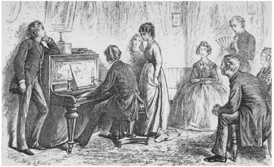
AT THE PIANO.

Miss Twinkleton now opining that indeed these were late hours, Mrs. Crisparkle, for finding ourselves outside the walls of the Nuns' House, and that we who undertook the formation of the future wives and mothers of England (the last words in a lower voice, as requiring to be communicated in confidence) were really bound (voice coming up again) to set a better example than one of rakish habits, wrappers were put in requisition, and the two young cavaliers volunteered to see the ladies home. It was soon done, and the gate of the Nuns' House closed upon them.