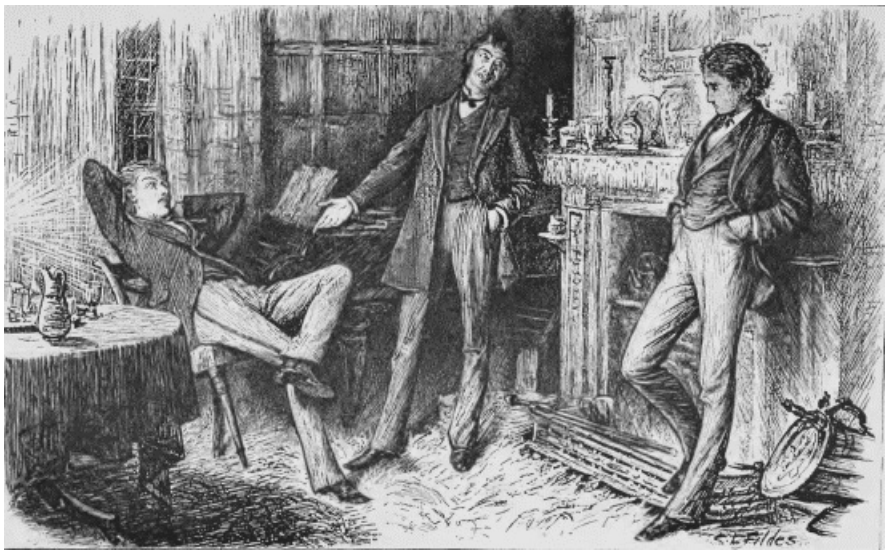
ON DANGEROUS GROUND

"Upon my soul, Jack," says Edwin, complacently, "I feel quite apologetic for having my way smoothed as you describe. But you know what I know, Jack, and it may not be so very easy as it seems, after all. May it, Pussy?" To the portrait, with a snap of his thumb and finger. "We have got to hit it off yet; haven't we, Pussy? You know what I mean, Jack."