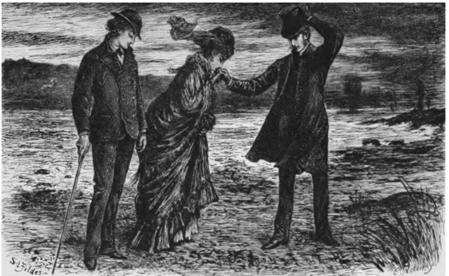
MR. CRISPARKLE IS OVERPAID.

"Tut!" said the Minor Canon, softly, "I am much overpaid!" And turned away.