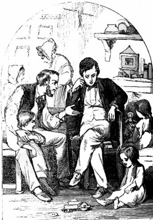
WHO IS WISEST?