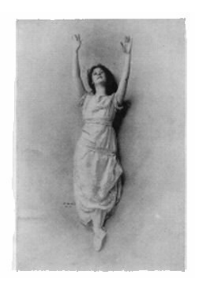
ISADORA DUNCAN: TWO EARLY PHOTOGRAPHS