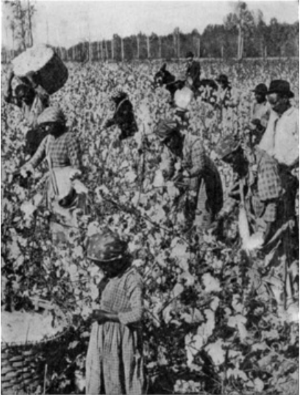
Picking Cotton on a Georgia Plantation.

These explorers found that on the other side of the Appalachian Mountains, for that was the name given to them, was a beautiful country, richer by far than that on the eastern side where they had been living. There were also many rivers flowing westward, making the soil rich and fertile. Forests of maple and elm trees, as well as pines, spruces, and oaks which were abundant along the coast, were to be seen there.