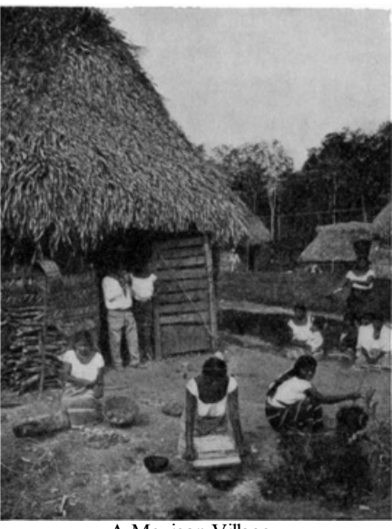
A Mexican Village.

The long climbing comes to an end at last. The double-engine has done its work and is used no longer, for we move out upon the plateau of Mexico where cactus plants spread over many acres, and wheat and barley fields greet us like old friends from the United States.