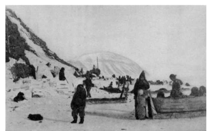
An Eskimo Village in Alaska.

They have their teams of dogs, which they pet and train. They have their skin-covered kayaks made in much the same way as those of the Greenland Eskimos, although it is very probable that they have never heard of their relations in that distant island. Mother Nature has provided certain things to maintain life in the frozen lands of the north,—not many to be sure; but the minds of those who dwell in places far distant from each other seem to have thought out much the same way of using them.