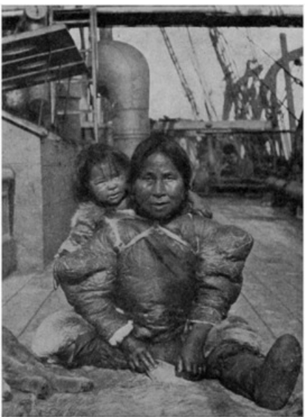
An Eskimo Mother and Baby.

These little strangers spoke an odd-sounding language and when they pointed to themselves they said, "Innuits," meaning "people." No doubt they and their parents had thought themselves the only people in the world. The Norsemen called them Skrællings; but long afterwards, when other white men came to Greenland and noticed the manner of living of the natives, they gave them the name of Eskimos which means, "Eaters of raw meat." To this day we know them as Eskimos.