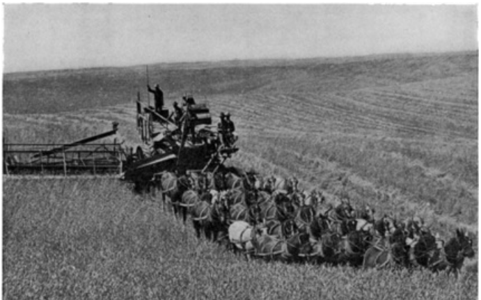
How They Harvest Wheat on the Prairies.

It is interesting to watch the work go on in the fields, it is so different from that of the old days before the threshing and binding machines were invented. It seems almost like magic to the watching children as acre after acre of waving grain is cut down, bound into sheaves and threshed, almost in the "twinkling of an eye."