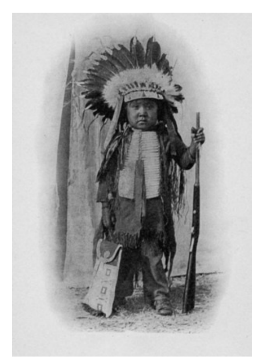
A Little Indian Boy.