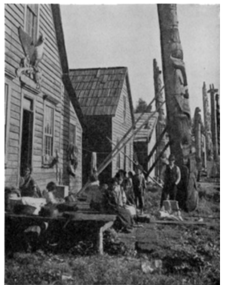
An Alaskan Village Showing Indian Totem Poles.

The Indian boys of Alaska could tell you many stories about the wild animals they hunt with their fathers. There are martens, with their soft brown fur, black and silver foxes, beavers, muskrats, mountain-goats, moose, deer, otter and many others which roam in great numbers over the hills and through the valleys. The Yukon River, one of the largest in the world, is the most important one in Alaska, and through the country on either side of it the wild animals are found in great numbers. The hunters get many of them in traps. There, on the banks of that great river, hundreds of canvas-back ducks lay their eggs on the platforms of grass and twigs which they build on the low marshes, and the Indian children go in parties to hunt for their eggs and the baby ducklings.