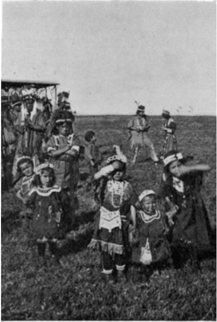
Little Canadian Indian Children.

Sometimes they let their ponies move along at a slow walk; but more often they gallop wildly along, with black hair waving in the air, and with bright and eager eyes. Then, too, the red children have canoes, in which they paddle on the lakes or streams near home.