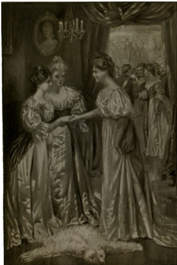
"Strangers and yet not strangers"

link somewhere. Of this she felt sure. She must solve the mystery, but not now. To find a spot to rest in was enough for the present.