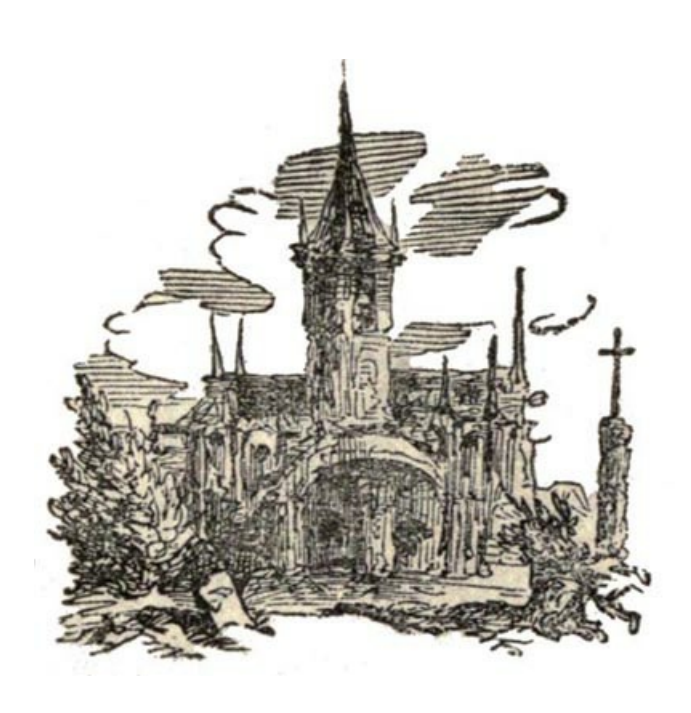
PARIS, PRINTING-OFFICE OF G. DOYEN, Rue Saint-Jacques, No. 38.