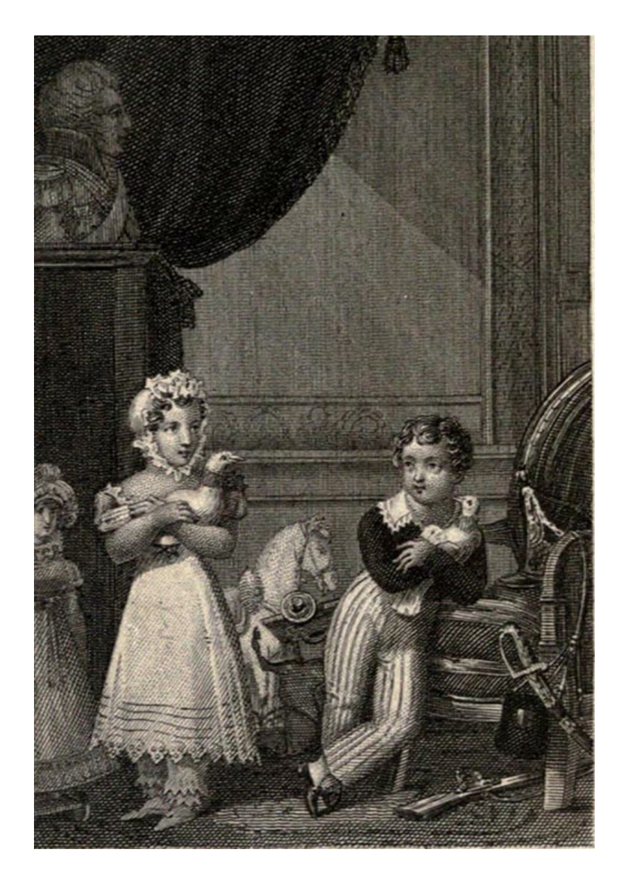
Chasselat del. Geoffroy sc.