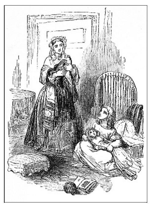
THE FLYING SQUIRREL

"No, my lady," she replied, "this is not a young beaver; a beaver is a much larger animal. A beaver's tail is not covered with fur; it is scaly, broad, and flat; it looks something like black leather, not very unlike that of my seal-skin slippers. The Indians eat beavers' tails at their great feasts, and think they make an excellent dish."