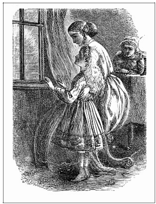
THE AURORA BOREALIS

Lady Mary replied, "Yes, Miss Campbell, I have often seen the sun rise, and once very early too, when I was ill, and could not sleep; for nurse lifted me in her arms out of bed, and took me to the window. The sky was all over of a bright golden colour, with streaks of rosy red; and nurse said, 'It is dawn; the sun will soon be up.' And I saw the beautiful sun rise from behind the trees and hills. He came up so gloriously, larger than when we see him in the middle of the sky; and I could look at him without hurting my eyes."