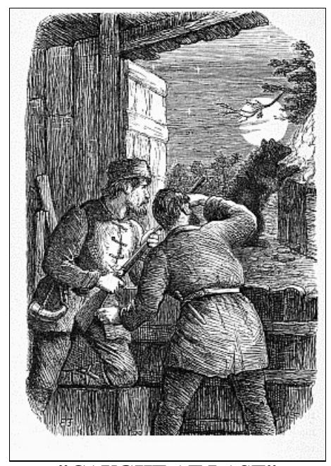
"CAUGHT AT LAST"

what is now a large town, but in those days consisted of only a few poor log-houses, a settler was much annoyed by the frequent visits of a bear to his hog-pen. At last he resolved to get a neighbour who was a very expert hunter to come with his rifle and watch with him. The pen where the fatling hogs were was close to the log-house; it had a long, low, shingled roof, and was carefully fastened up, so that no bear could find entrance. Well, the farmer's son and the hunter had watched for two nights, and no bear came; on the third they were both tired, and lay down to sleep upon the floor of the kitchen, when the farmer's son was awakened by a sound as of some one tearing and stripping the shingles from the pen. He looked out; it was moonlight, and there he saw the dark shadow of some tall figure on the ground, and spied the great black bear standing on its hinder legs, and pulling the shingles off as fast as it could lay its big black paws upon them. The hogs were in a great fright, screaming and grunting with terror. The young man stepped back into the house, roused up the hunter, who took aim from the doorway, and shot the bear dead. The head of the huge beast was nailed up as a trophy, and the meat was dried or salted for winter use, and great were the rejoicings of the settlers, who had suffered so much from Bruin's thefts of corn and pork."