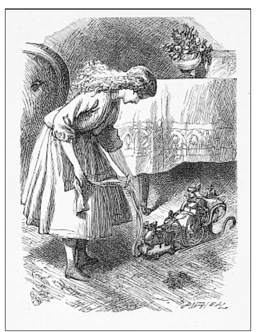
LADY MARY SLEIGHING HER DOLL

"I remember, nurse, that my dormice used to lie quite still, nestled among the moss and wool in their little dark chamber in the cage, all day long; but when it was night they used to come out and frisk about, and run along the wires, and play all sorts of tricks, chasing one another round and round, and they were not afraid of me, but would let me look at them while they ate a nut, or a bit of sugar; and the dear little things would drink out of their little white saucer, and wash their faces and tails—it was so pretty to see them!"