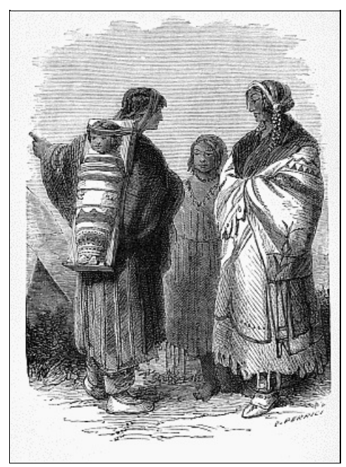
INDIAN SQUAW AND BABY

"The Indian women sew some things with the roots of the tamarack, or larch; such as coarse birchbaskets, bark canoes, and the covering of their wigwams. They call this 'wah-tap'<sup>[C]</sup> (wood-thread), and they prepare it by pulling off the outer rind and steeping it in water. It is the larger fibres which have the appearance of small cordage when coiled up and fit for use. This 'wah-tap' is very valuable to these poor Indians. There is also another plant, called Indian hemp, which is a small shrubby kind of milk-weed, that grows on gravelly islands. It bears white flowers, and the branches are long and slender; under the bark there is a fine silky thread covering the wood; this is tough, and can be twisted and spun into cloth. It is very white and fine, and does not easily break. There are other plants of the same family, with pods full of fine shining silk; but these are too brittle to spin into thread. This last kind, Lady Mary, which is called Milk-weed flytrap, I will show you in summer." [D]