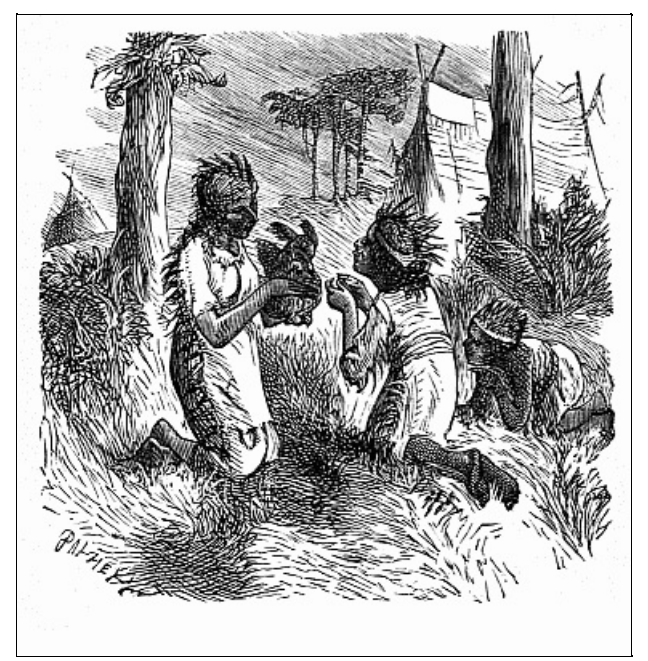
THE PET SQUIRREL