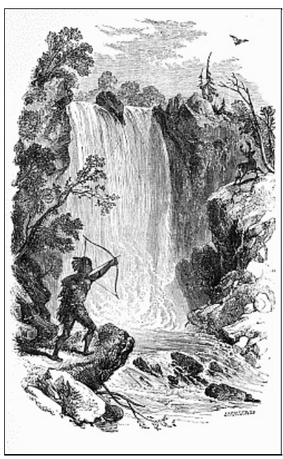
HUNTING THE DEER

"But their flesh is very savoury, and the Indian, when tired of bear's meat, is glad of a dish of fresh venison. So with his gun—if he has one—or with his bow and arrow, he lies in wait among the foliage and brushwood of the forest, or behind the rocks on the bank of some swift torrent, and when the unsuspecting stag makes his appearance on the opposite crag, he takes a careful aim, lets fly his rapid arrow, and seldom fails to kill his victim; which, dropping into the stream below, is borne by the current within his reach."