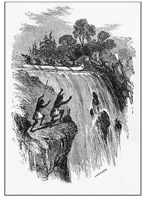
GOING DOWN THE RAPIDS

"A party of Indians were rowing in a canoe on one of the great American rivers. As they passed a thick clump of trees, a young fawn suddenly sprang out, and, frightened by their cries, leaped into the water. For some days the rain had been heavy; the river was therefore running with a wild, impetuous current; and the fawn was carried along by the rushing tide at a tremendous rate. The Indians, determined to capture it, paddled down the stream with eager haste, and in their excitement forgot that they were in the neighbourhood of a great rapid, or cataract; dangerous at all times, but especially so after long-continued rains. On, on, they went! Suddenly the fawn disappeared, and looking behind them, the startled Indians found themselves on the very brink of the rapid! Two of their countrymen, standing on a rock overhanging the foaming waters, saw their peril, and by shouts and gestures warned them of it. With vigorous efforts they turned the prow of their canoe, and endeavoured to cross the river. They plied their paddles with all the desperation of men who knew that nothing could save them but their own exertions, that none on earth could help them. But the current proved too strong. It carried them over the fall, and dashed their bark broadside against a projecting rock. A moment, and all was over! Not one of them was ever seen again!"