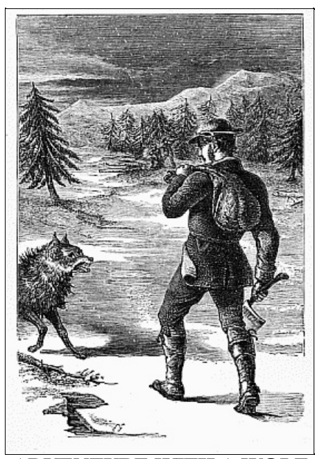
ADVENTURE WITH A WOLF

"I would have run away," said Lady Mary.