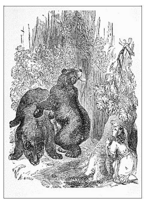
THE LOST CHILD AND THE BEARS

"It was not the child's home, but a farm belonging to a miller who knew her father, and had been in search of her for several days; and he and his wife were very glad when they saw the lost child, and gladly showed her preserver the way. They rejoiced very much when the poor wanderer was restored safe and well to her sorrowing parents."