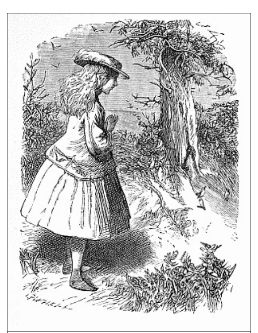
WATCHING THE BIRDS

"But, nurse, the sun shines, and there are little streams of water running along the streets in every direction. See, the snow is gone from under the bushes and trees in the garden. I saw some dear little birds flying about, and I watched them perching on the dry stalks of the tall, rough weeds, and they appeared to be picking seeds out of the husks. Can you tell me what birds they were?"