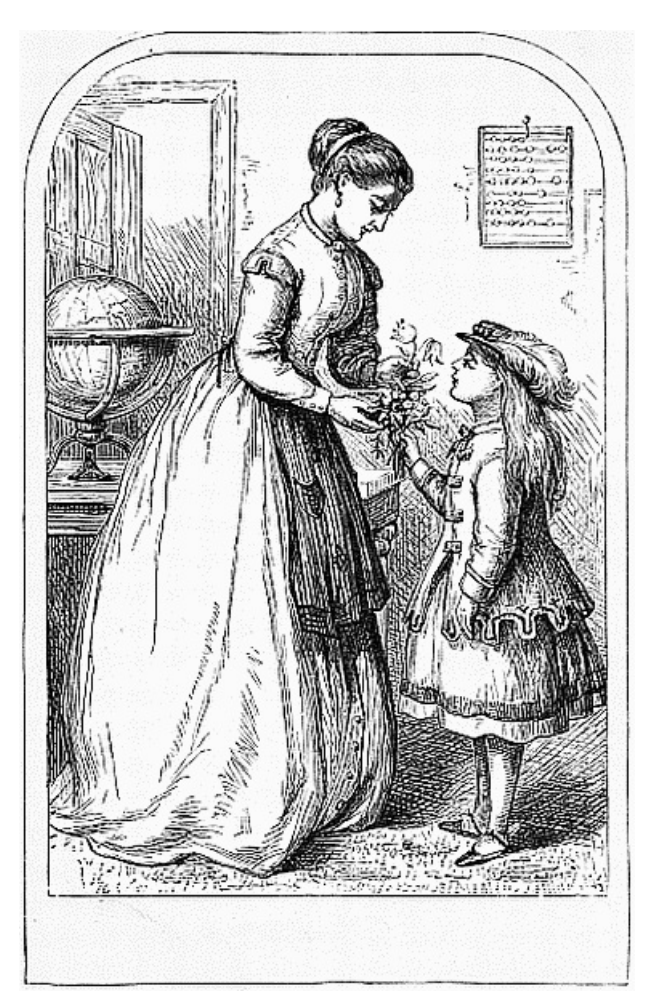
THE NOSEGAY. Page 199.