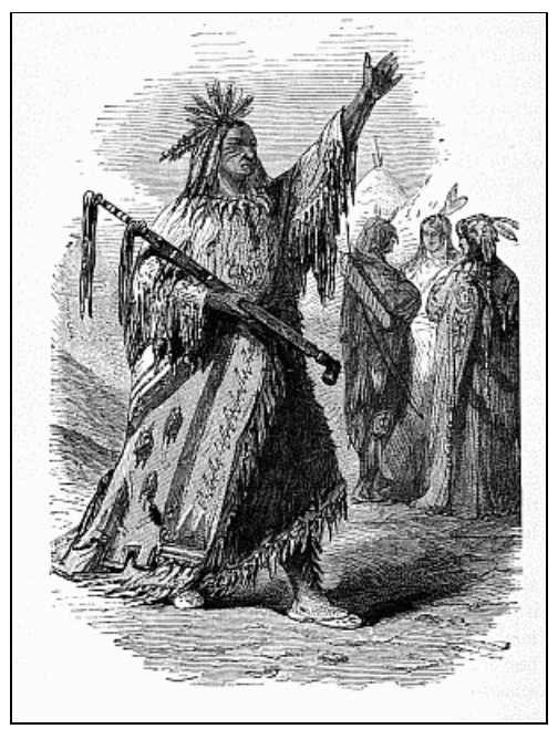
INDIAN CHIEF ADDRESSING HIS TRIBE

shores of the great lakes, and on the banks of the vast rolling rivers."