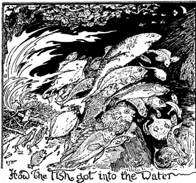
How the fish got into the water

'Let me try,' cried Biernuga, the bony fish, but he had no better luck, and no more had Kumbal, the bream, nor any of the rest.