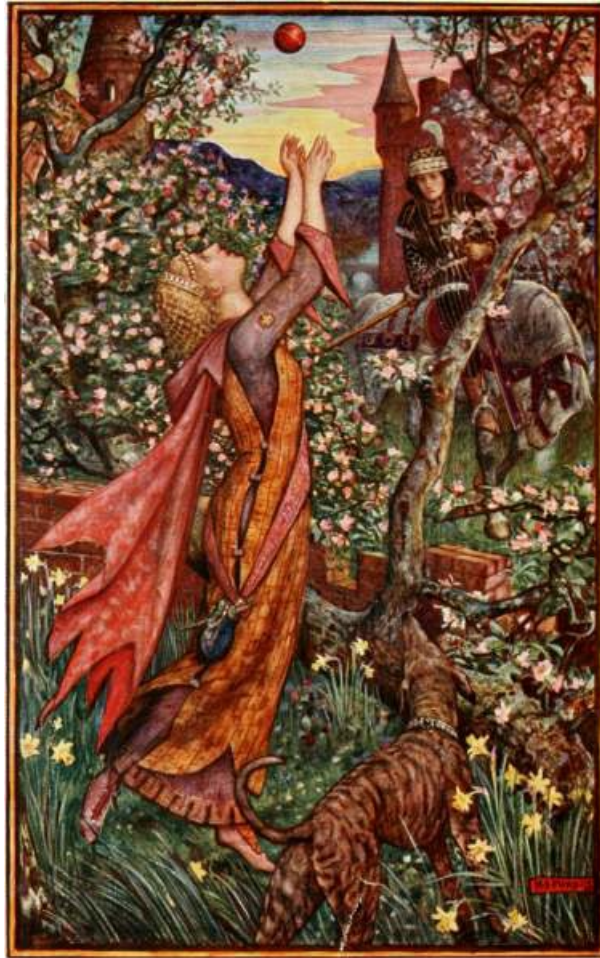
"How the King found the girl playing at ball in the orchard."