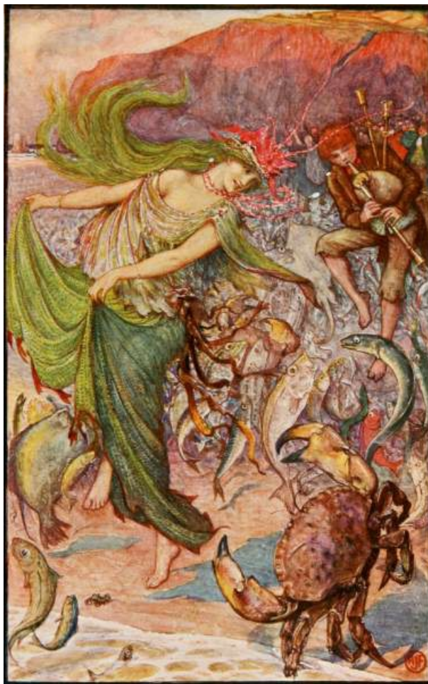
The Sea-lady allures Maurice into the Sea.

When Maurice's mother saw him with that unnatural thing in the form of a green-haired lady as his guide, and he and she dancing down together so lovingly to the water's edge, through the thick of the fishes, she called out after him to stop and come back. 'Oh, then,' says she, 'as if I was not widow enough before, there he is going away from me to be married to that scaly woman. And who knows but 'tis grandmother I may be to a hake or a cod—Lord help and pity me, but 'tis a mighty unnatural thing! And may-be 'tis boiling and eating my own grandchild I'll be, with a bit of salt butter, and I not knowing it! Oh, Maurice, Maurice, if there's any love or nature left in you, come back to your own ould mother, who reared you like a decent Christian!' Then the poor woman began to cry and sob so finely that it would do anyone good to hear her.