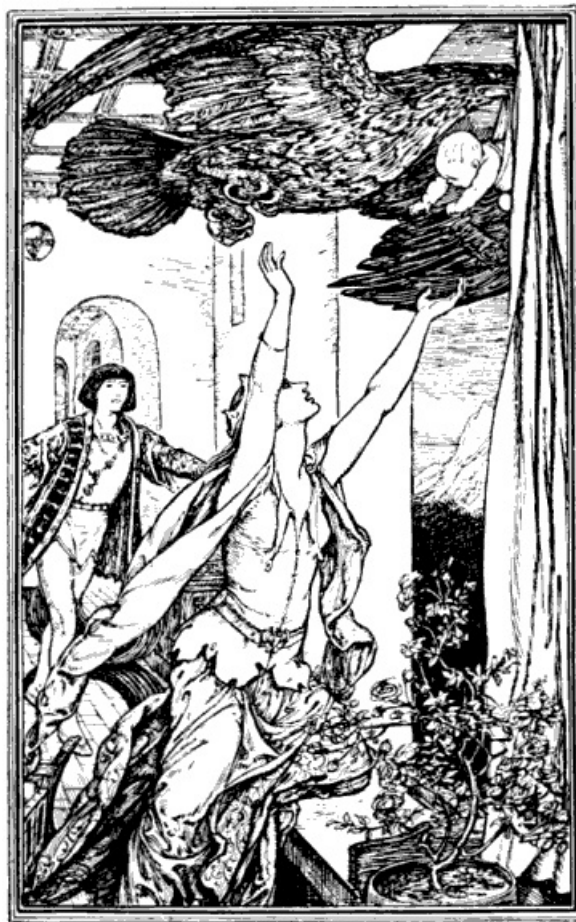
The Princess loses her first Baby.

In time she told them all that happened to her, and they didn't know what to advise her to do. She was as fond of her husband as ever, and said she was sure that he couldn't help letting the children go; but still she was afraid beyond the world to have another child torn from her. Well, the mother and sisters consulted a wise woman that used to bring eggs to the castle, for they had great faith in her wisdom. She said the only plan was to secure the bear's skin that the prince was obliged to put on every morning, and get it burned, and then he couldn't help being a man night and day, and the enchantment would be at an end.