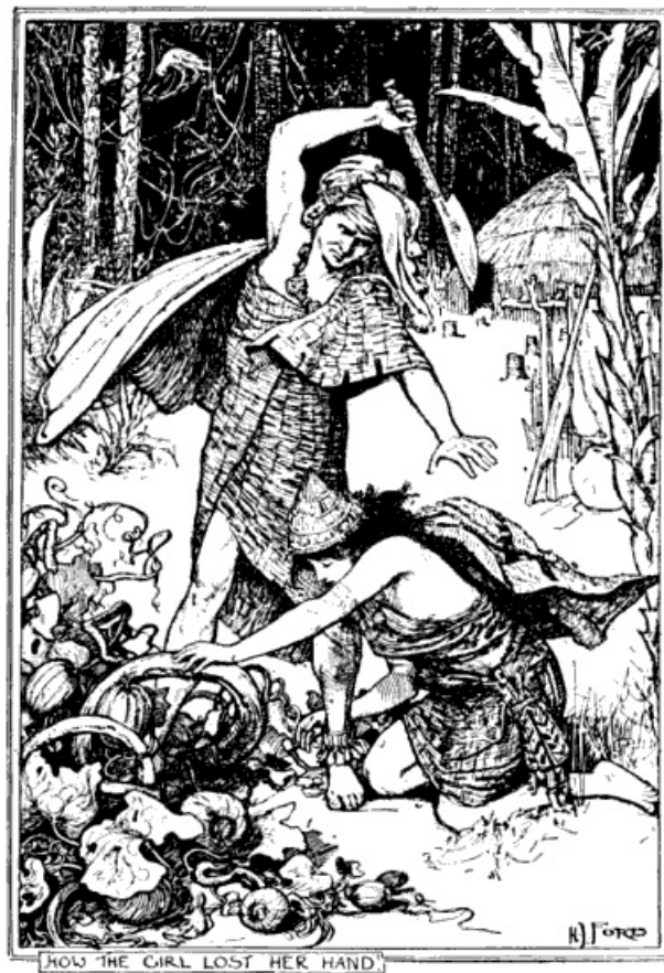
HOW THE GIRL LOST HER HAND

When she woke up on the seventh morning she saw from her perch smoke coming up from a little town on the edge of the forest. The sight of the huts made her feel more lonely and helpless than before. She longed desperately for a draught of milk from a gourd, for there were no streams in that part, and she was very thirsty, but how was she to earn anything with only one hand? And at this thought her courage failed, and she began to cry bitterly.