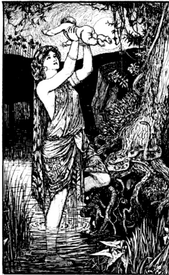
MY BABY, MY BABY !"

'The sun is hot,' said the snake, 'and you have walked far. Take your baby and bathe in that cool place where the boughs of the tree stretch far over the water.'