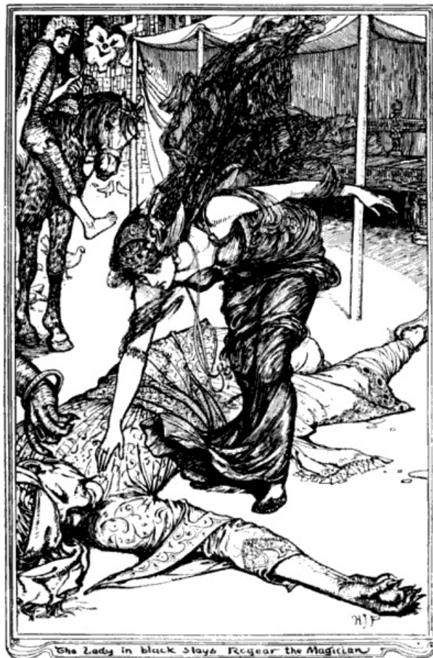
The Lady in black slays Rogear the Magician

'The flower that laughs opens all doors and lightens all darkness,' said the lady; and as she spoke, they reached the further bank, and advanced towards the castle.