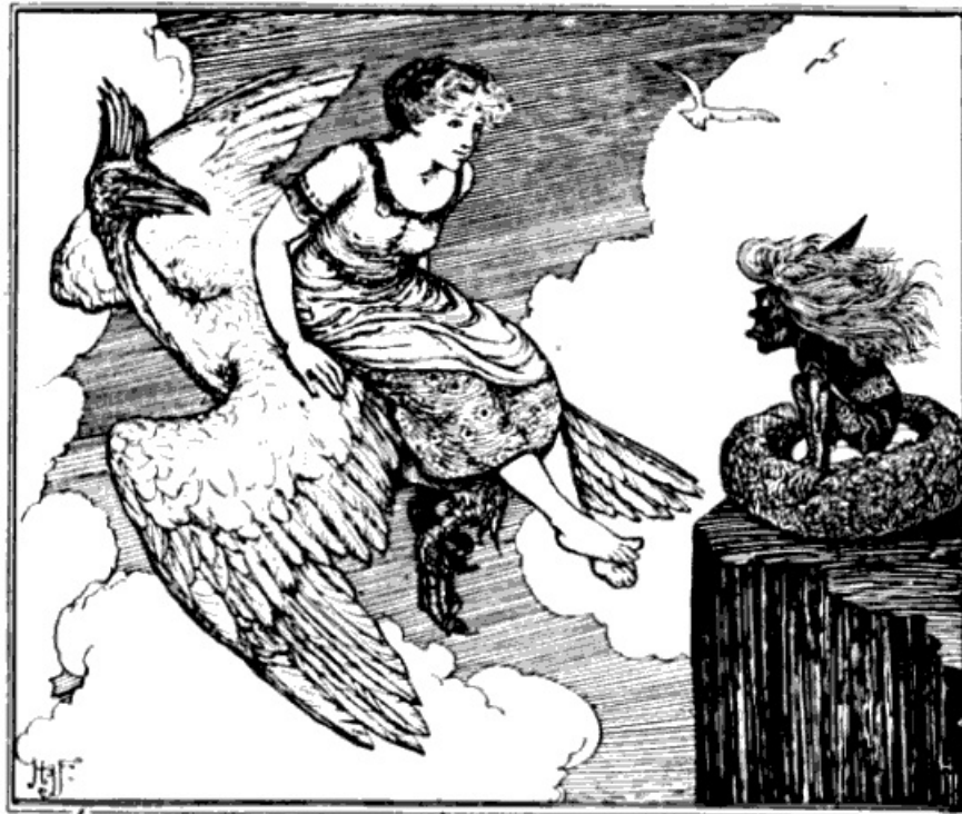
HOW BELLAH FOUND KORANDON

'I am sitting on six eggs of stone, and I shall not be set free till they are hatched.'