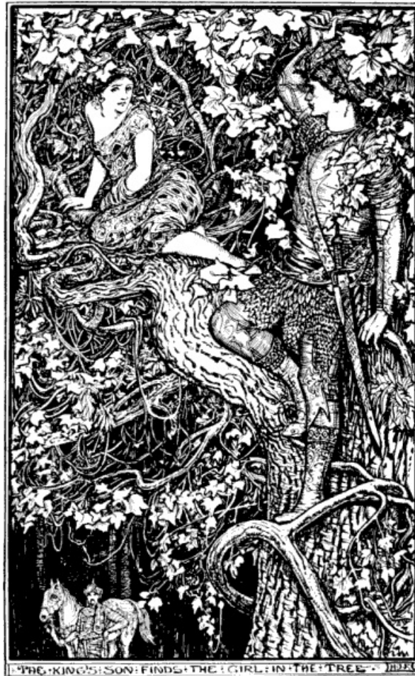
THE KING'S SON FINDS THE GIRL IN THE TREE

'Tell my father and mother that I have a fever, and want some gruel,' said he, 'and bid them send it quickly.'