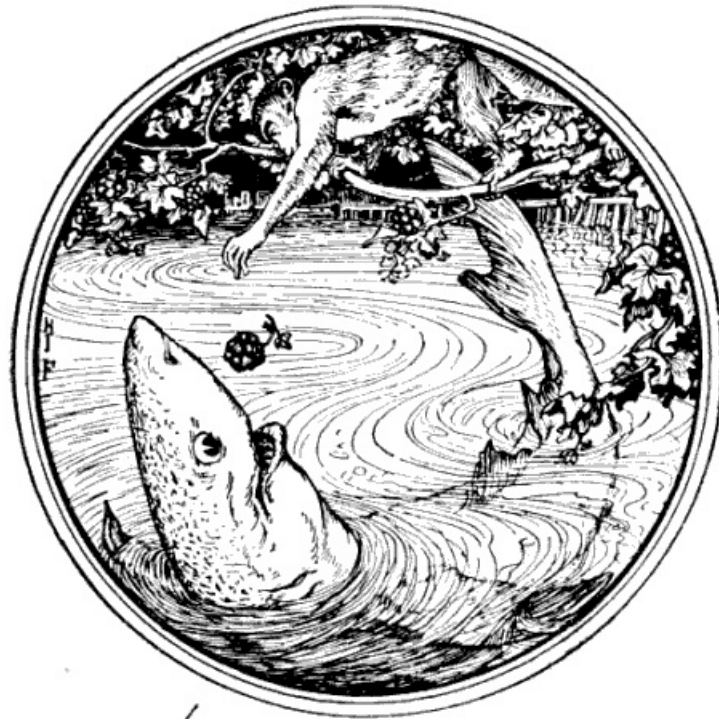
The Monkey feeds the SHARK

'Well, I don't like salt myself,' said the monkey; 'so if you will open your mouth I will throw this beautiful juicy kuyu into it,' and, as he spoke, he pulled one off the branch just over his head. But it was not so easy to hit the shark's mouth as he supposed, even when the creature had turned on his back, and the first kuyu only struck one of his teeth and rolled into the water. However, the second time the monkey had better luck, and the fruit fell right in.