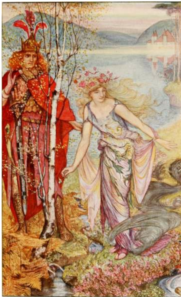
"When she stood upright her ugliness had all gone."

'If my father loses that game, and you win it,' said she, 'accept nothing for your prize but the shaggy young horse with the stick saddle.'