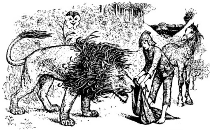
How Peronnik tricked the Viper-maned Lion with a bag

Now this was just what Peronnik had been hoping for, so he held the bag while the lion opened it carefully and put his head right inside, so that he might get a good mouthful of larks. But the mass of feathers and glue stuck to him, and before he could pull his head out again Peronnik had drawn tight the cord, and tied it in a knot that no man could untie. Then, quickly gathering the flower that laughs, he rode off as fast as the colt could take him.